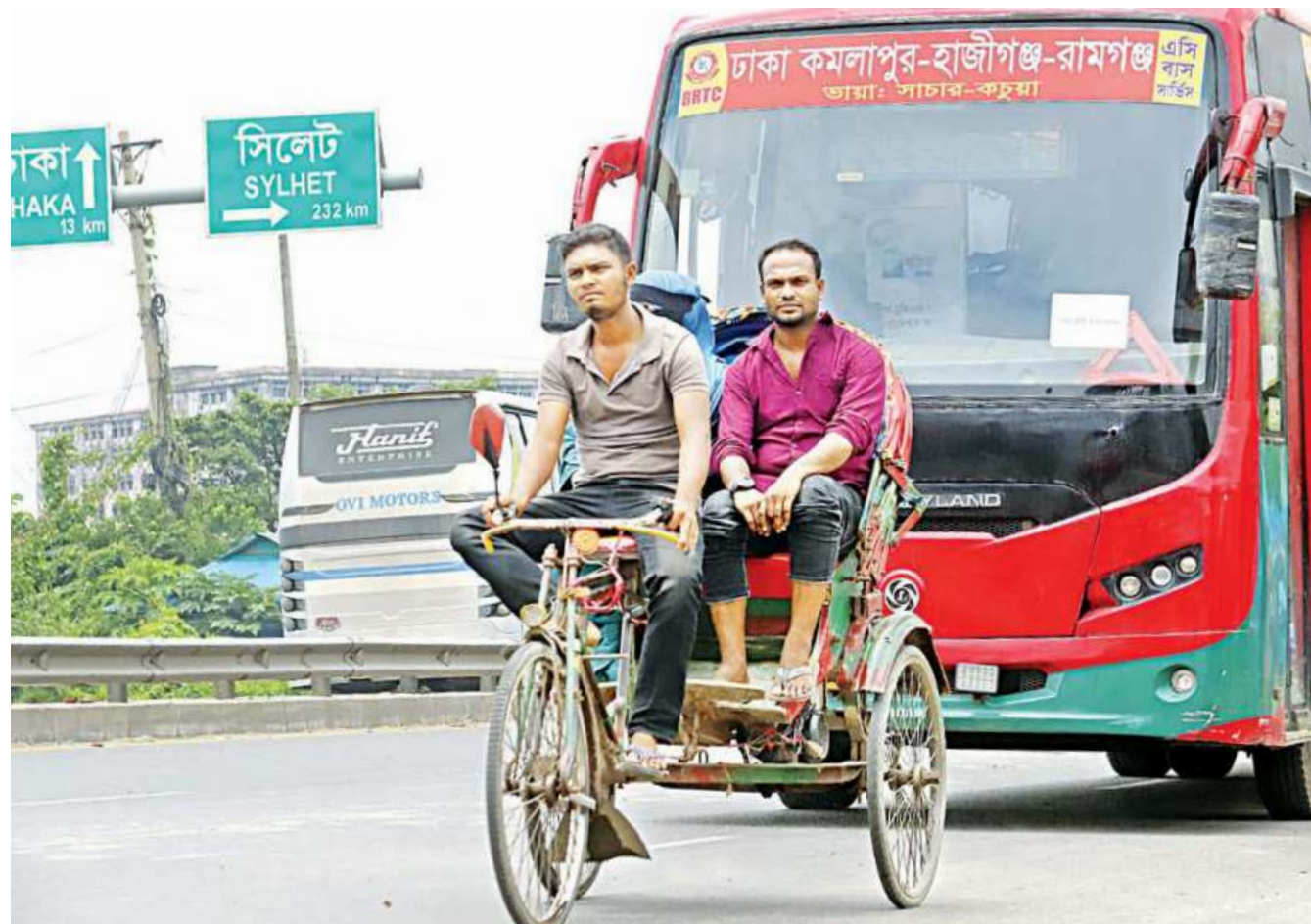
A battery-run rickshaw is running dangerously in front of a bus on the Dhaka-Chattogram highway. Defying a ban, slow-moving vehicles like this rickshaw and other three-wheelers get in the way of fast-moving vehicles on the highway regularly. The photo was taken near Kanchpur Bridge in Narayanganj recently.