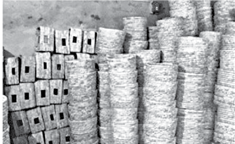
Women in rural areas of Satkhira's Kalaroa upazila make a variety of laundry baskets, place mats, rectangular baskets, kitchen baskets, cylinder baskets, etc while they are able to work from the comfort of their homes.

"We use date palm leaves and straw as raw materials. Our products are being exported to 10 countries including those in Europe after meeting up the orders from the country," Palash said.