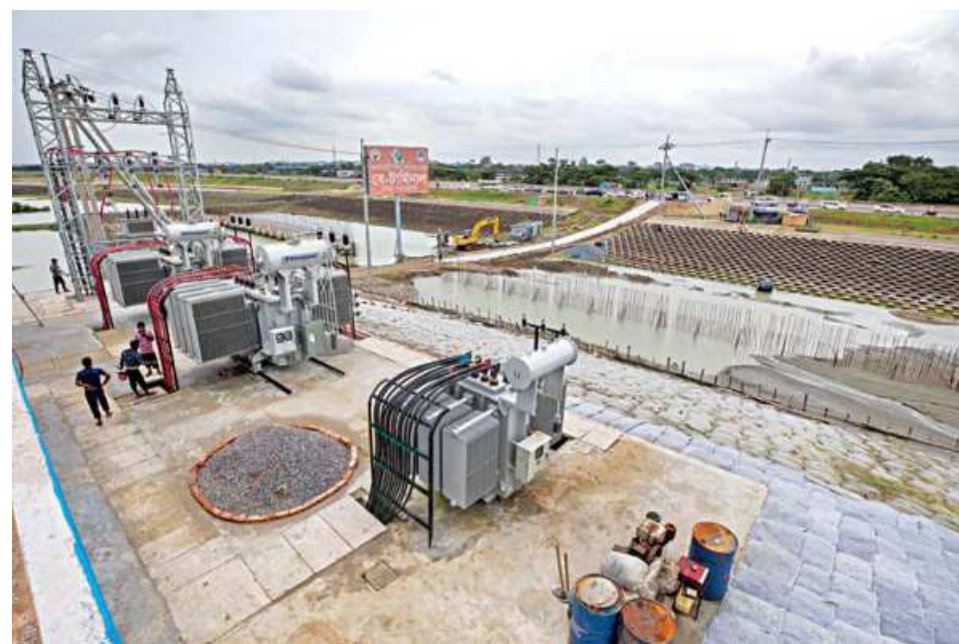
Construction work for Bay Terminal, a long-awaited mega expansion project of the Chattogram port, has gained momentum as the government has set 2024 to start operation of the terminal. The photos were taken yesterday.

Talks on the Bay Terminal began in 2011 as the prospect of building a mega container terminal emerged after an 11km natural island surfaced from the seabed near the Halishahar