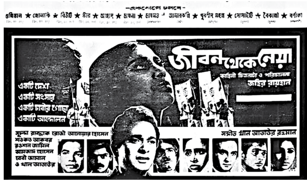
Poster for Jibon Thekey Neyya (1970).