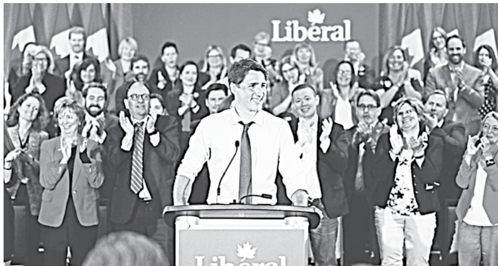
Dashing, youthful, and apparent heir to his father Pierre Trudeau's legacy, Trudeau was deemed by the international media as the poster boy for Western liberalism.

Trudeau has made no secret of his ambitions for a bigger and bolder role for the federal government. His regime has taken a much broader systematic approach towards consolidating policy programmes that have traditionally been under the purview of provincial or regional governments—in many ways contradicting Canada's decentralised system of governance, termed "federalism". In fairness, this was an acknowledgement of the