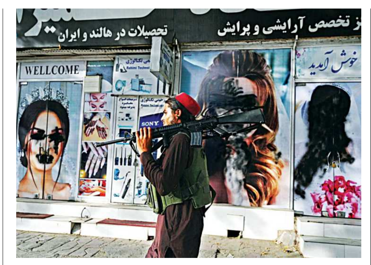
A Taliban fighter walks past a beauty saloon with images of women defaced using spray paint in Shar-e-Naw in Kabul, Afghanistan, yesterday.