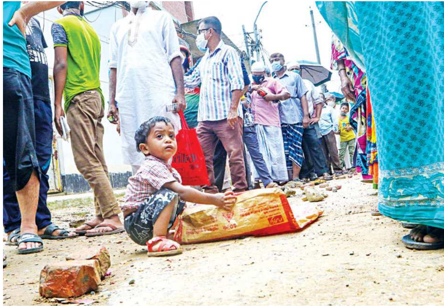
Exhausted, a child prepares an empty cement bag to sit on as he waits for his mother. The mother was yesterday standing in a long queue to purchase essential commodities from a TCB truck at reasonable prices in the capital's Sachibalay Link Road.