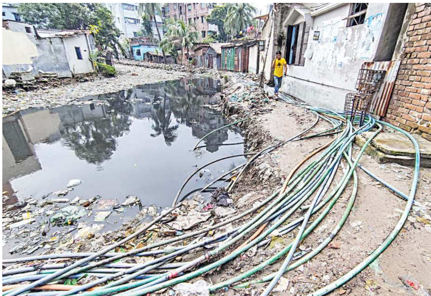
Some locals in the capital's Jurain area install unauthorised pipelines to get supply water to homes beside the Shyampur canal. The canal is also in a sorry state with garbage obstructing the flow of water, creating an idea breeding ground for mosquitos. The photo was taken recently.