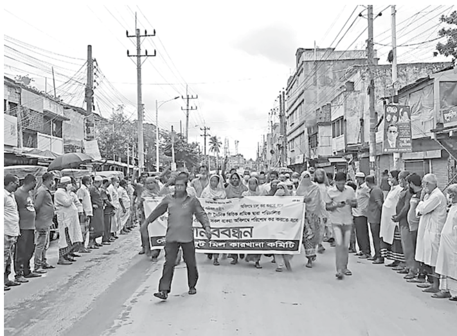
Temporary workers of closed state-run jute mills demonstrated in front of Khalishpur Jute Mill on Khulna city's BIDD Road yesterday, demanding resumption of all such mills under government initiative.

More than 32,000 substitute and temporary workers of the closed jute mills were denied compensation packages though many of them had worked at the mills for decades.