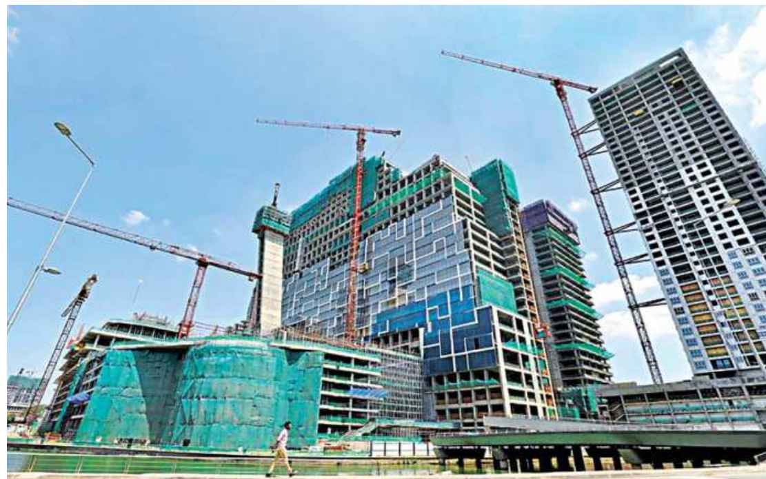
A man walks past the construction sites of new apartments and luxury hotels in the capital city Colombo of Sri Lanka.

This week, the three-month Libor is 0.14 per cent and the six-