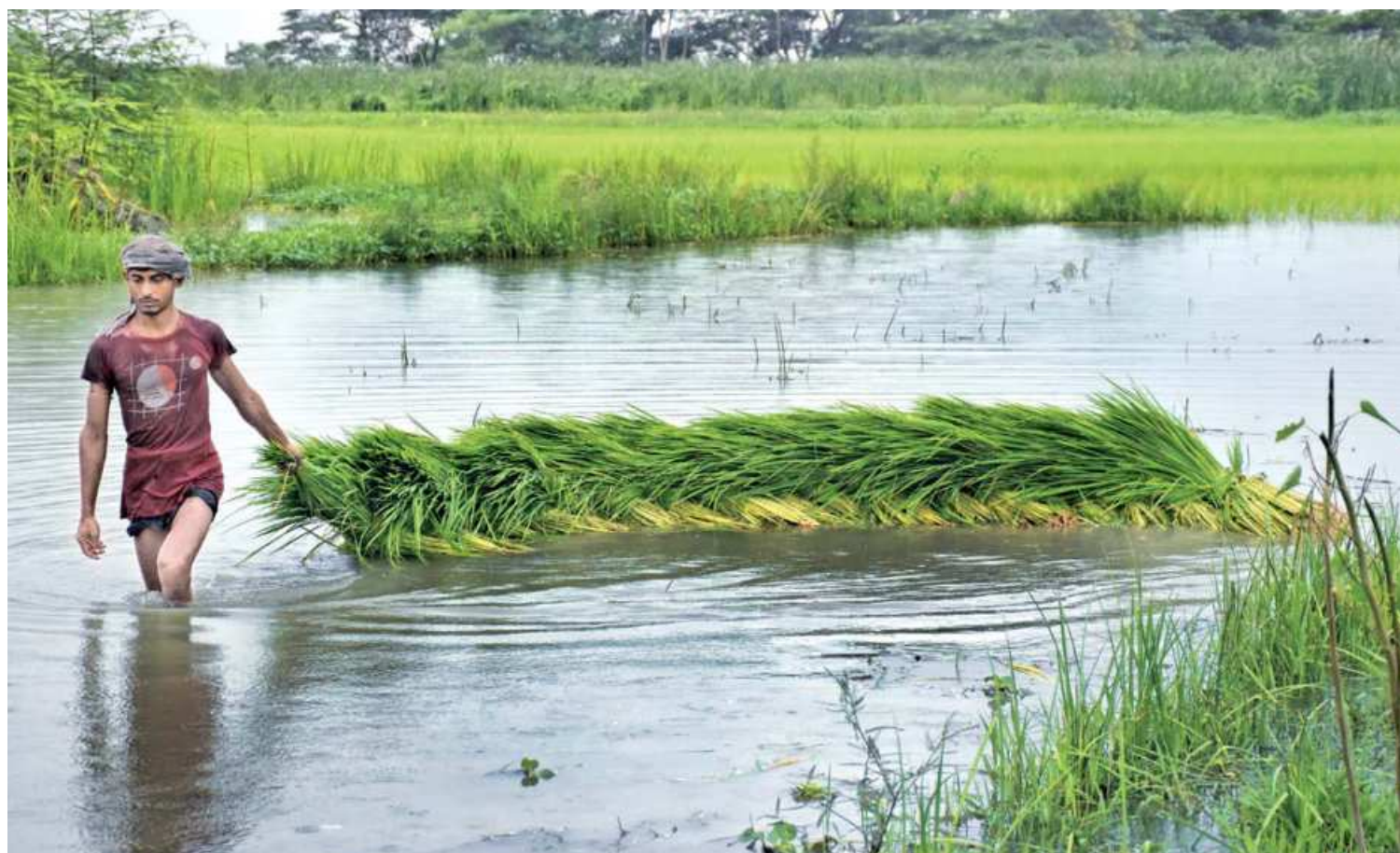
A farmer transferring a floating bed of Aman saplings from the nursery for transplanting in his main cropland. According to Bangladesh Rice Research Institute, the country's annual requirement of rice for consumption is 35 million tonnes. The United States Department of Agriculture estimates 35.8 million tonnes of rice were produced in 2020. In 2021, production is projected to be more than 37 million tonnes. The photo was taken at Moddhom Rayapur village of Jhalakathi yesterday.