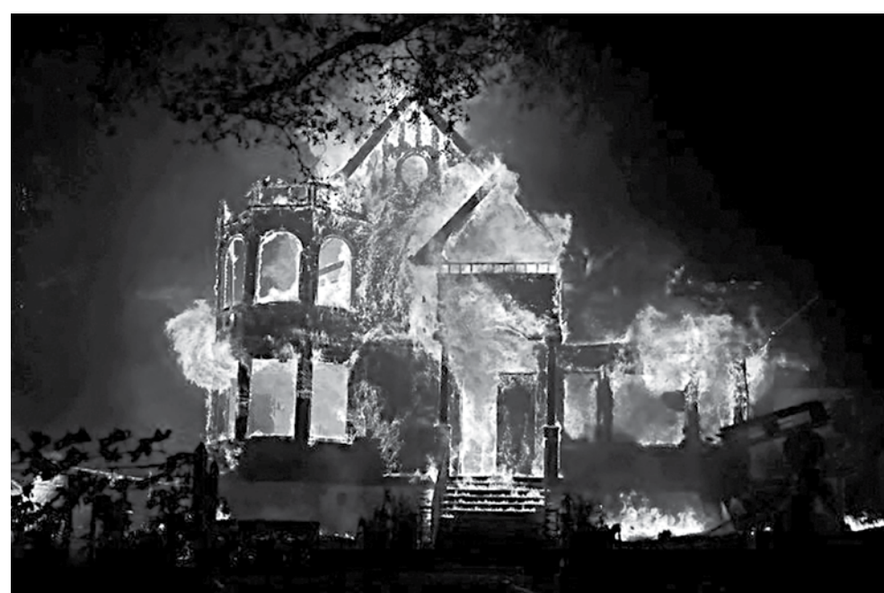
A home is engulfed in flames during the Glass Fire in St Helena, California, US.

Current emissions and the future of our planet