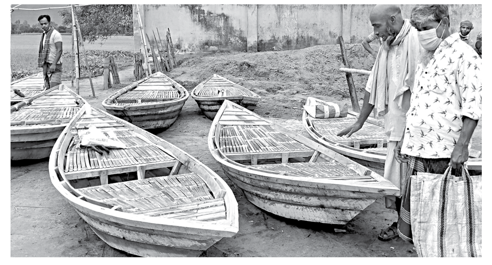
In this recent photo, boats are seen put on display by sellers at Shamspara boat market in Atrai upazila of Naogaon.