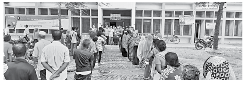
Volunteers selling food items at lower prices among people in need at Jashore municipality premises.

Tk 300 in the local markets. The Moitree Haat committee was formed on April 22, 2020 with 30 volunteers and two executive members