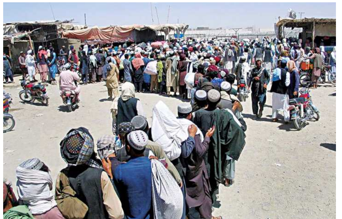
People wait to cross into Afghanistan, at the Friendship Gate crossing point at the Pakistan-Afghanistan border town of Chaman, Pakistan on August 13.

Pakistan's IMF programme is its thirteenth in 30 years and is needed to help the government tackle a public debt of about 90 per cent of GDP. Any Taliban attacks inside Pakistan could raise security concerns and make it harder for Islamabad to meet targets set by the IMF. At the same time, some investors say, they could increase Pakistan's strategic importance for the West.