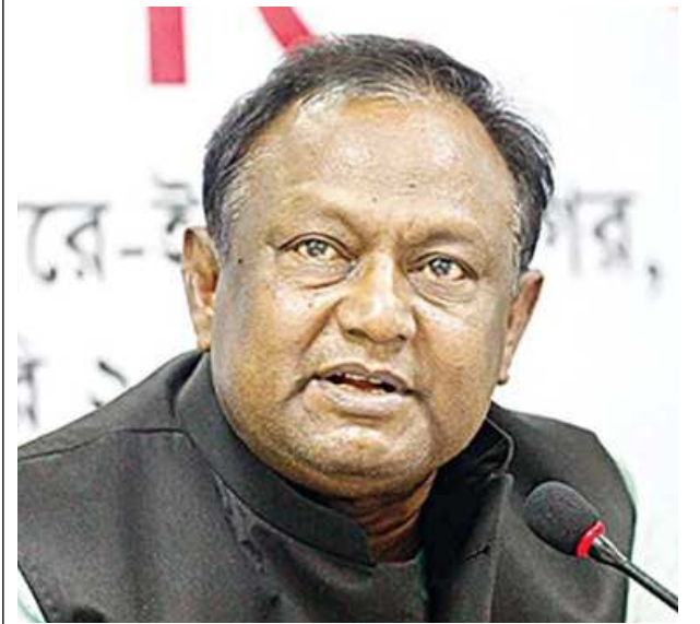
Commerce Minister Tipu Munshi

Tipu Munshi urges foreign investors, NRBs at US event