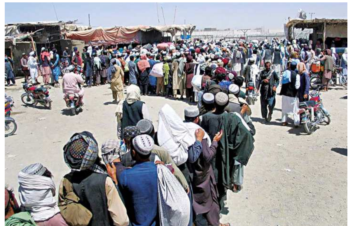
People wait to cross into Afghanistan, at the Friendship Gate crossing point at the Pakistan-Afghanistan border town of Chaman, Pakistan on August 13.

Pakistan's IMF programme is its thirteenth in 30 years and is needed to help the government tackle a public debt of about 90 per cent of GDP. Any Taliban attacks inside Pakistan could raise security concerns and make it harder for Islamabad to meet targets set by the IMF. At the same time, some investors say, they could increase Pakistan's strategic importance for the West.