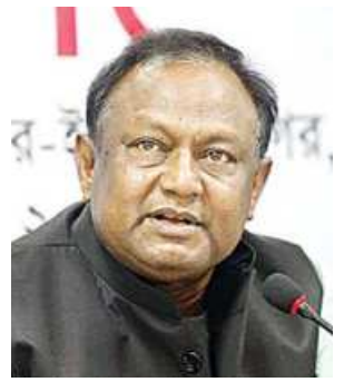
TIPU MUNSHI COMMERCE MINISTER

Speakers at a seminar in the US called upon foreign investors and non-resident Bangladeshis (NRBs) to invest in Bangladesh.