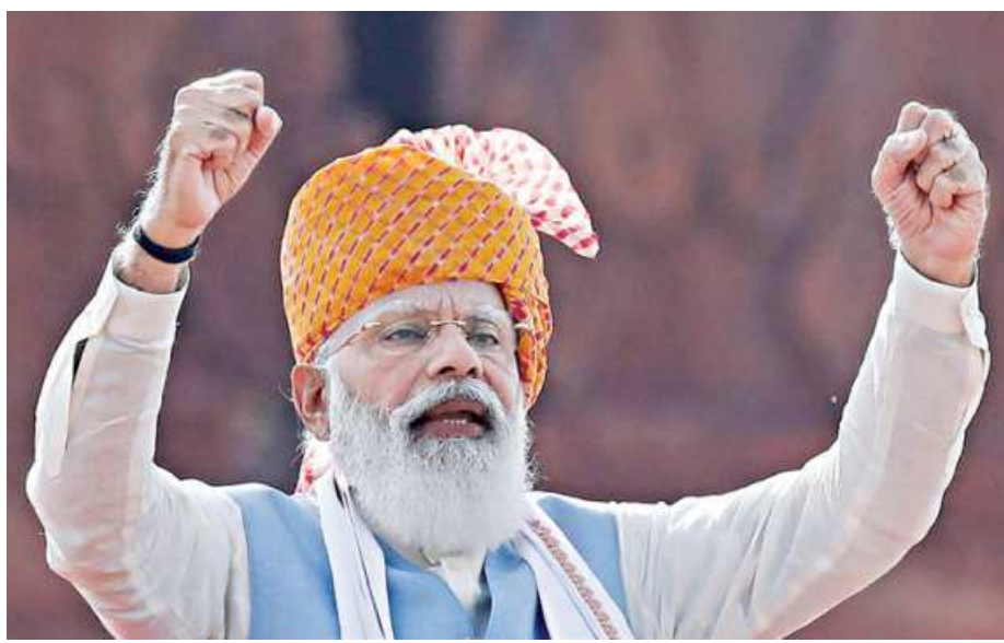
Indian Prime Minister Narendra Modi addresses the nation during Independence Day celebrations at the historic Red Fort in Delhi, India yesterday.