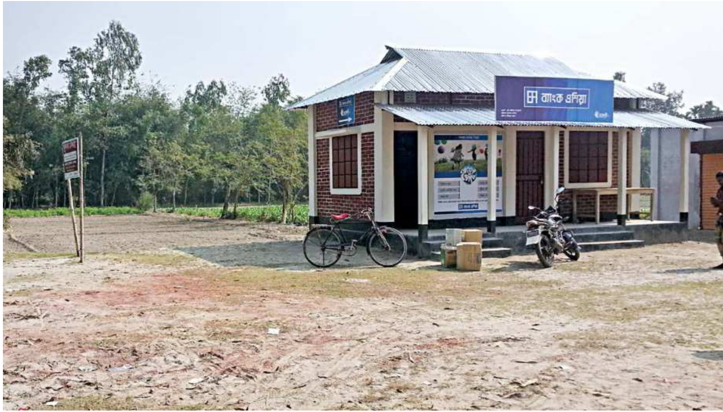
Collected: Bangladesh Bank has awarded 28 agent banking licences with the aim to provide a secure alternative delivery channel of banking services to the underprivileged and under-served population who live in remote locations.