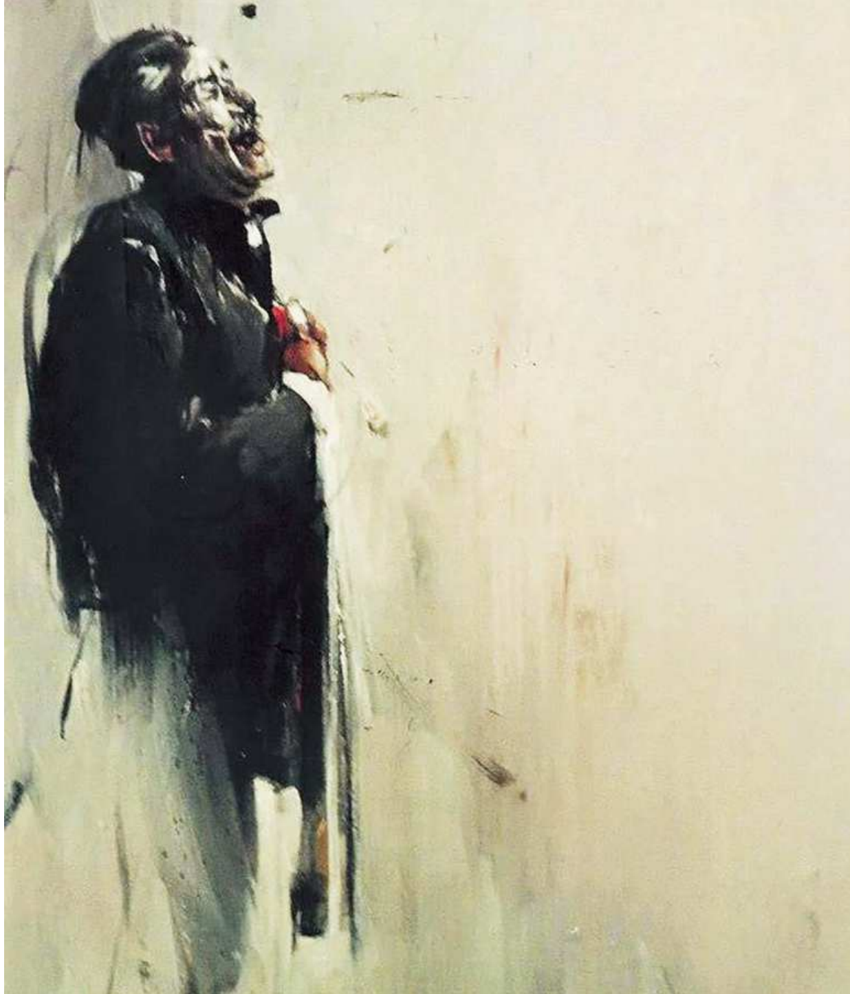
PAINTING: SHAHABUDDIN AHMED

The First Five-Year Plan and the portrait of his "Sonar Bangla"