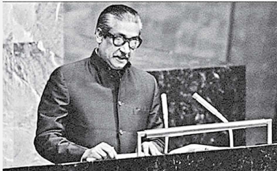
All our foreign policy messages must continue to rebroadcast Bangabandhu's universal message of peace with justice and equity for all that he resonantly called for in his address to the United Nations in October 1974.