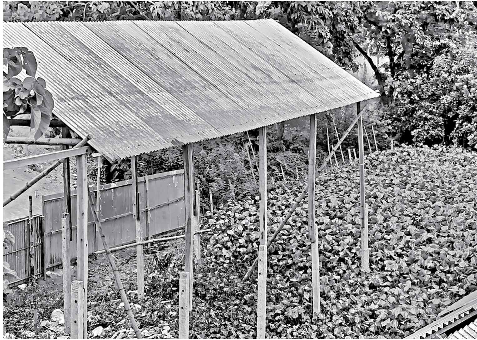
Two local leaders belonging to Awami League and Jamaat-e-Islami have allegedly joined hands grabbing 35 decimals of government canal in Kartimari area of Jadurchar union of Kurigram's Roumari upazila. The photo has been taken recently.