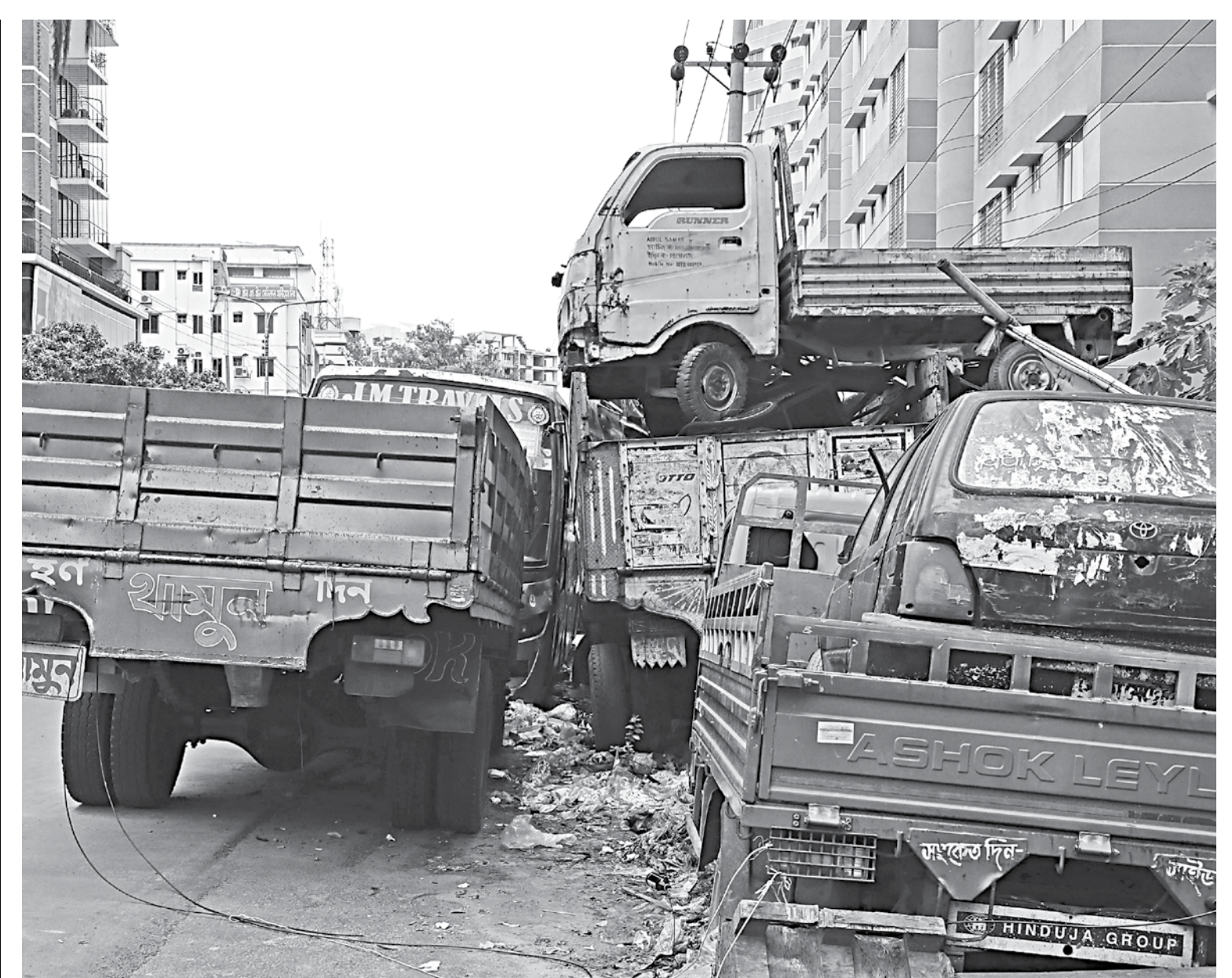
The footpath on the opposite side of Adabar Police Station is treated as a dump for seized vehicles by the police. As a result, pedestrians are forced to walk on the road, slowing down vehicular movement and putting all at risk. This photo was taken yesterday from Ring Road.