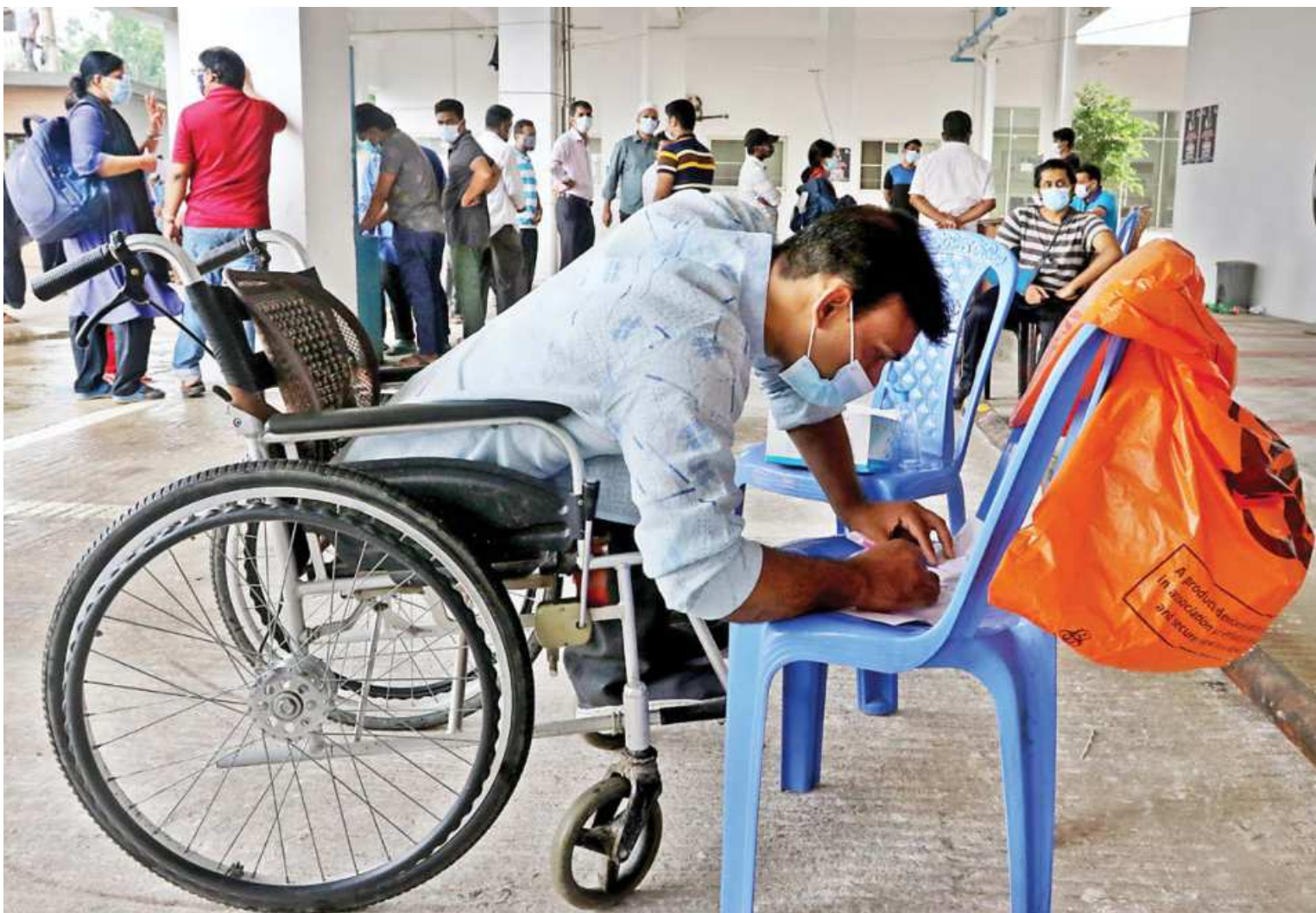
A man on a wheelchair filling out a form to get tested for Covid-19 at the Mugda Medical College Hospital in the capital yesterday.