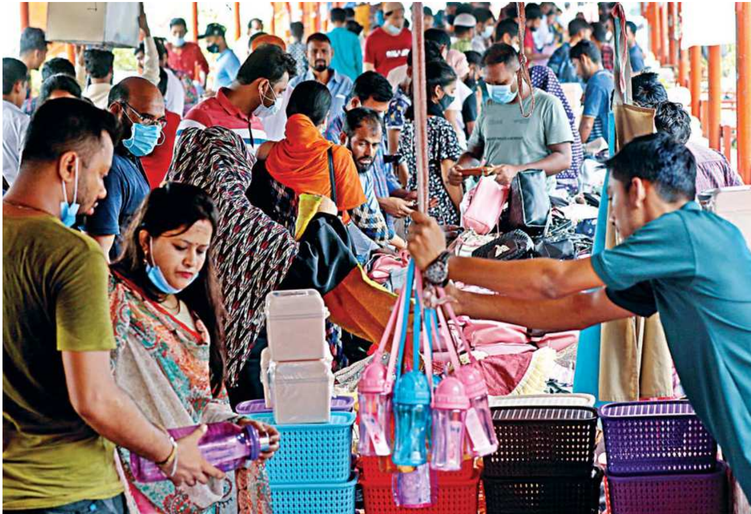
People ignoring social distancing and health safety guidelines while shopping from hawkers on a foot bridge near the capital's New Market yesterday, the first weekend after the government lifted restrictions it imposed to curb the spread of Covid-19.