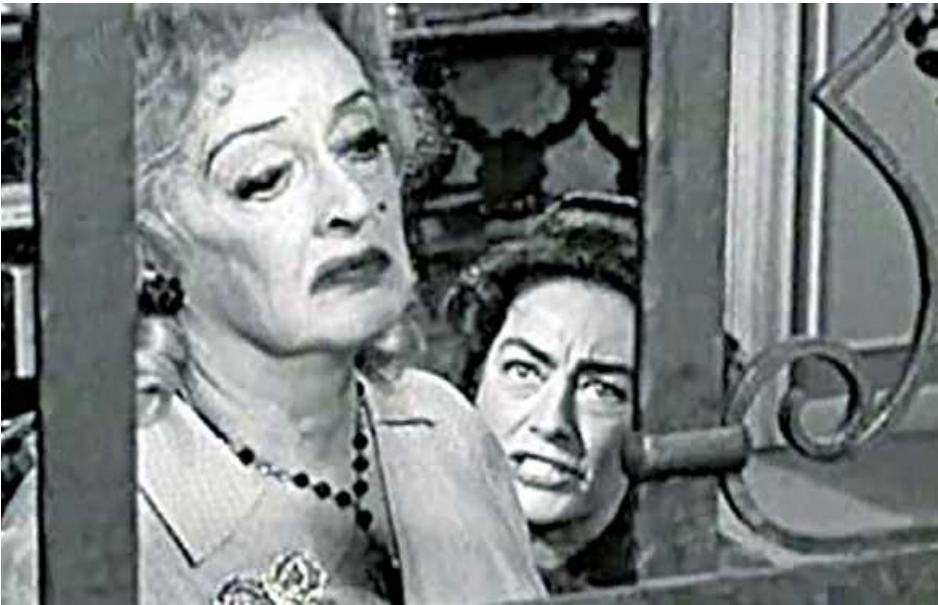
‘What Ever Happened to Baby Jane?’

‘What Ever Happened to Baby Jane?’ is a 1960s claustrophobic thriller/horror film which established an archetype for many great books and films across generations to come.