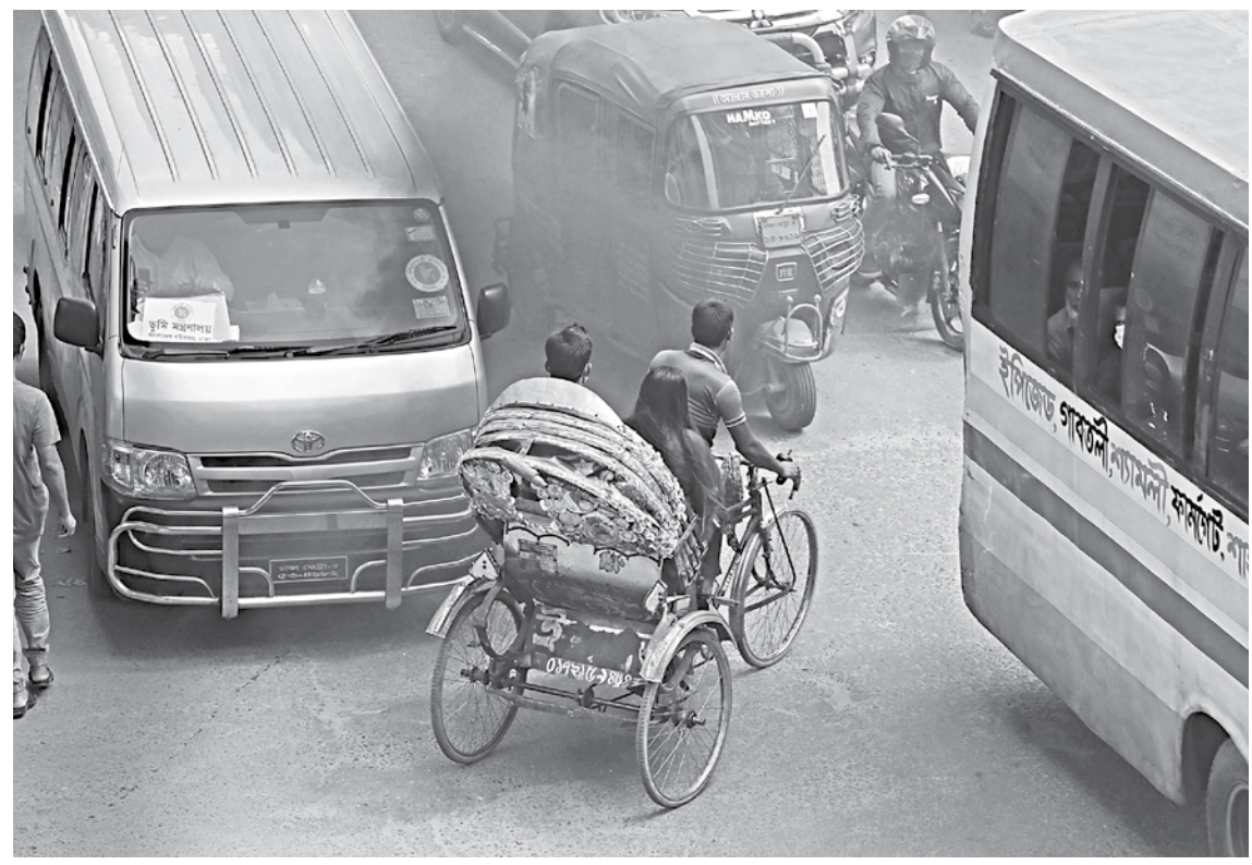
A rickshaw-puller, engulfed by the black smog emanating from a nearby bus, tries to sneak through oncoming traffic in a bid to save a bit of time, but risking his and the passengers' lives in the process. This photo was taken yesterday.