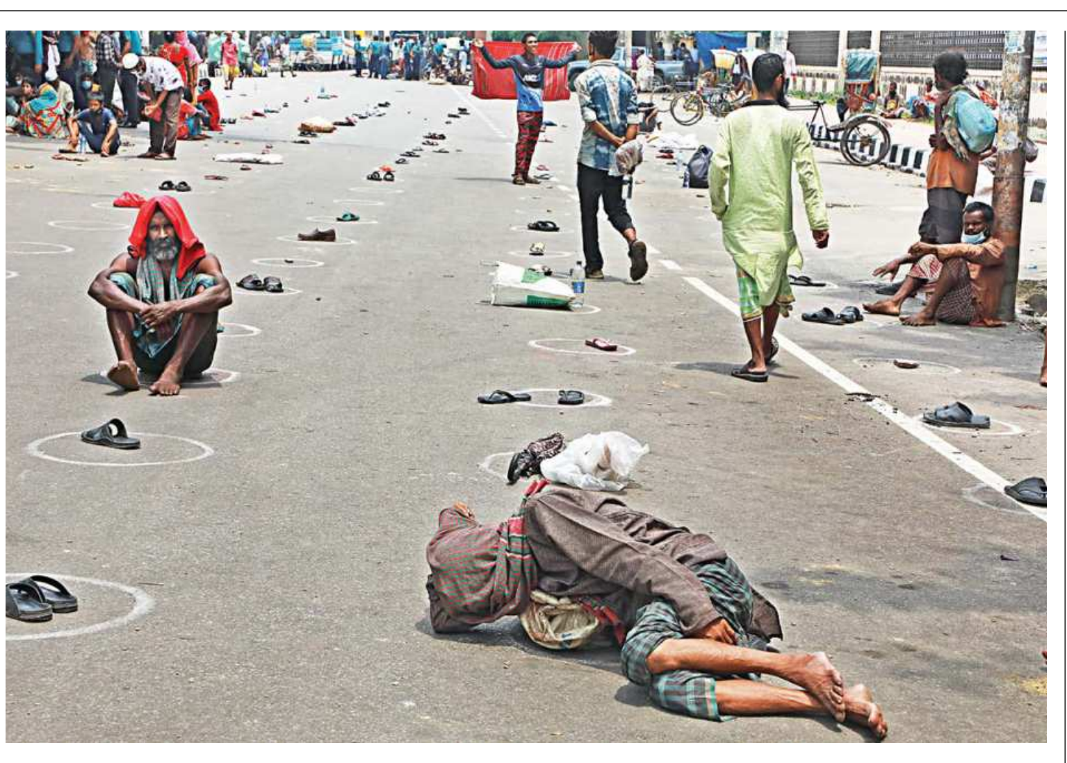
A man takes a nap and another sits nearby while waiting for free food distributed by police in Paribagh area of the capital yesterday. Unable to endure the sun, many left sandals, as placeholders, in the circles drawn on the street to ensure physical distancing.