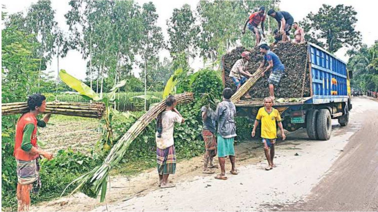
Sugarcane being loaded onto a truck in Taraganj upazila in Rangpur district last week for sale in markets. This year, sugarcane was cultivated on 49,900 acres of land in sugar mill-catchment areas while the total area used was 1.09 lakh acres in 2020.