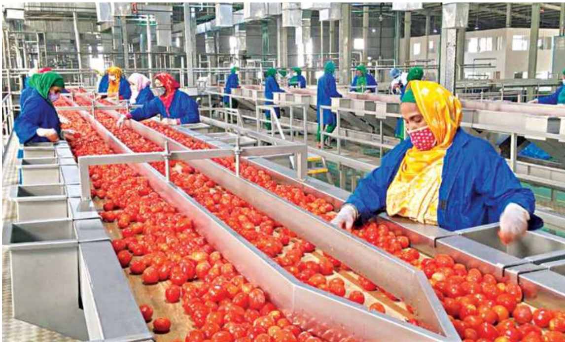
Bangladesh should produce better quality and more value-added agricultural items to compete in the international market, an industry expert says.

Experts say at FBCCI webinar on Bangabandhu's thoughts on agriculture