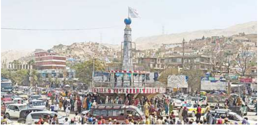
A Taliban flag is seen on a plinth yesterday after the insurgents captured Pul-e-Khumri, the capital of Baghlan province.

It came as President Ashraf Ghani flew in to Mazar-i-Sharif to rally old warlords to the defence of the biggest city in the