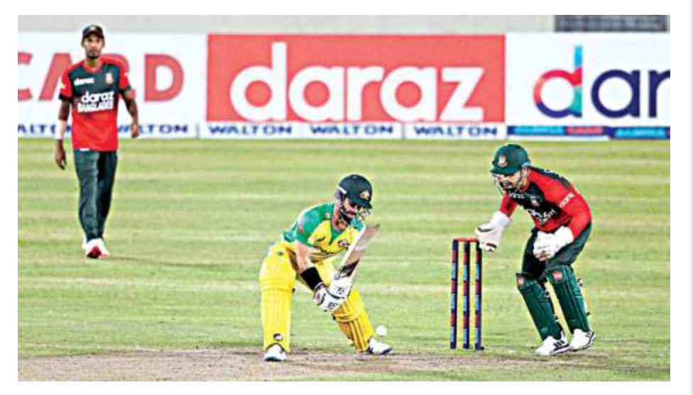
Batsmen from both Bangladesh and Australia found going tough in low, slow and turning wickets in Mirpur during the just concluded five-match T20I series.

The question now is whether the thinktank will think about another series win on low, turning tracks against New Zealand or give some much-needed focus on the