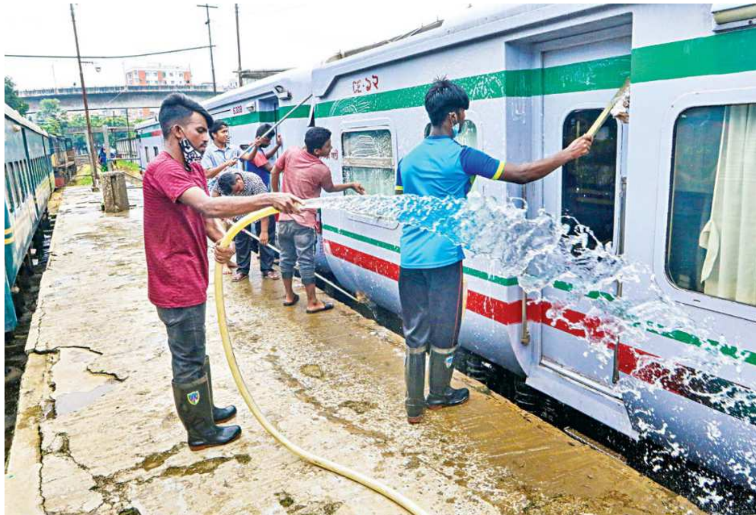
Bangladesh Railway staffs washing train carriages as those would be in service from today after a long break due to the lockdown imposed by the government to curb the spread of coronavirus. The photo was taken at Kamalapur Railway Station in the capital yesterday.

Chanting "Messi, Messi, SEE PAGE 2 COL 6