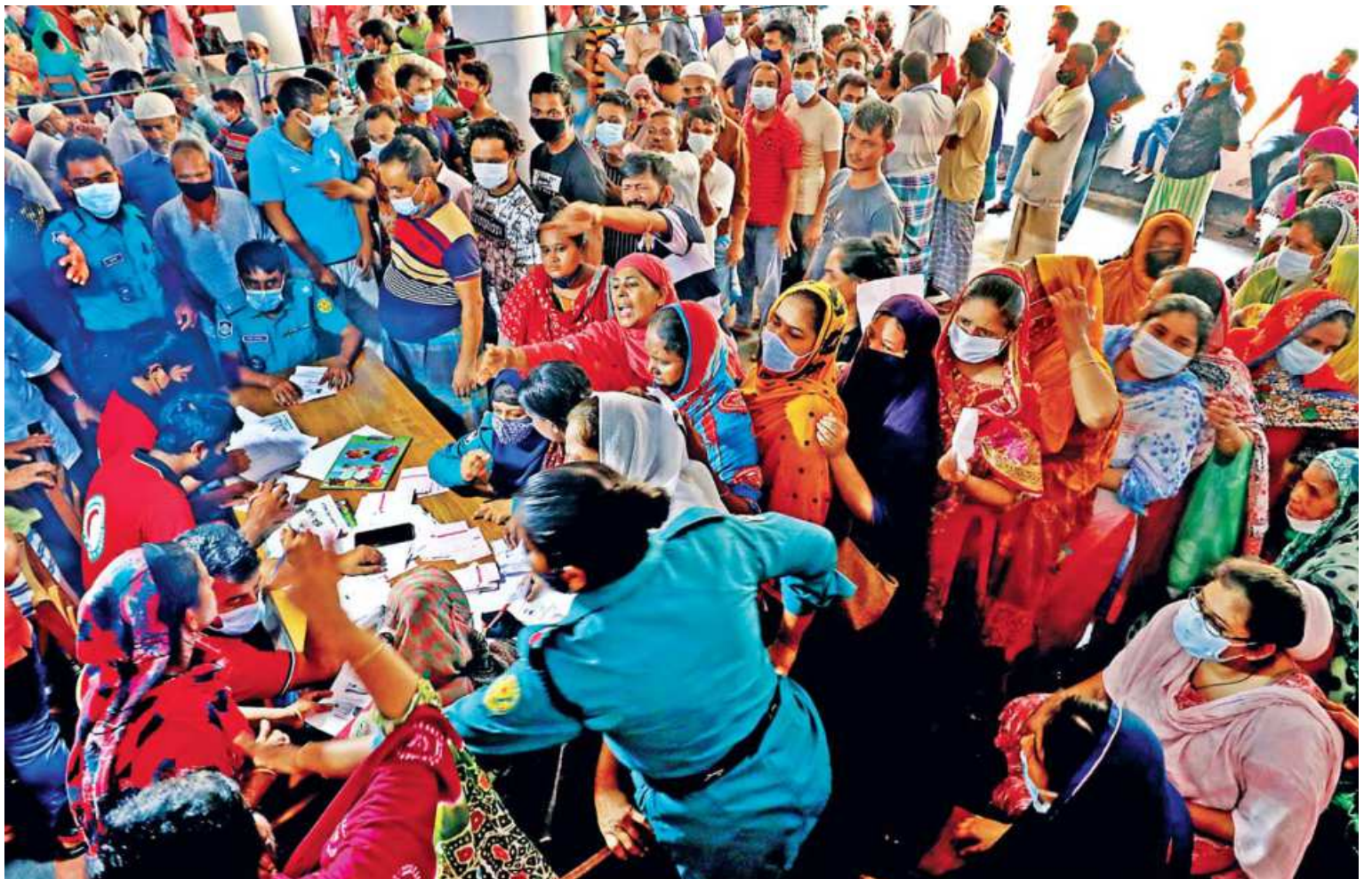
A huge crowd at a temporary Covid-19 vaccination centre in the capital's Jurain area forced the authorities to call for police help to conduct their vaccination activities. The photo was taken on Alimul Millat Madrasa premises yesterday.