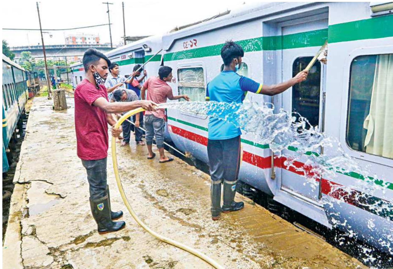
Bangladesh Railway staffs washing train carriages as those would be in service from today after a long break due to the lockdown imposed by the government to curb the spread of coronavirus. The photo was taken at Kamalapur Railway Station in the capital yesterday.

Chanting "Messi, Messi, SEE PAGE 2 COL 6