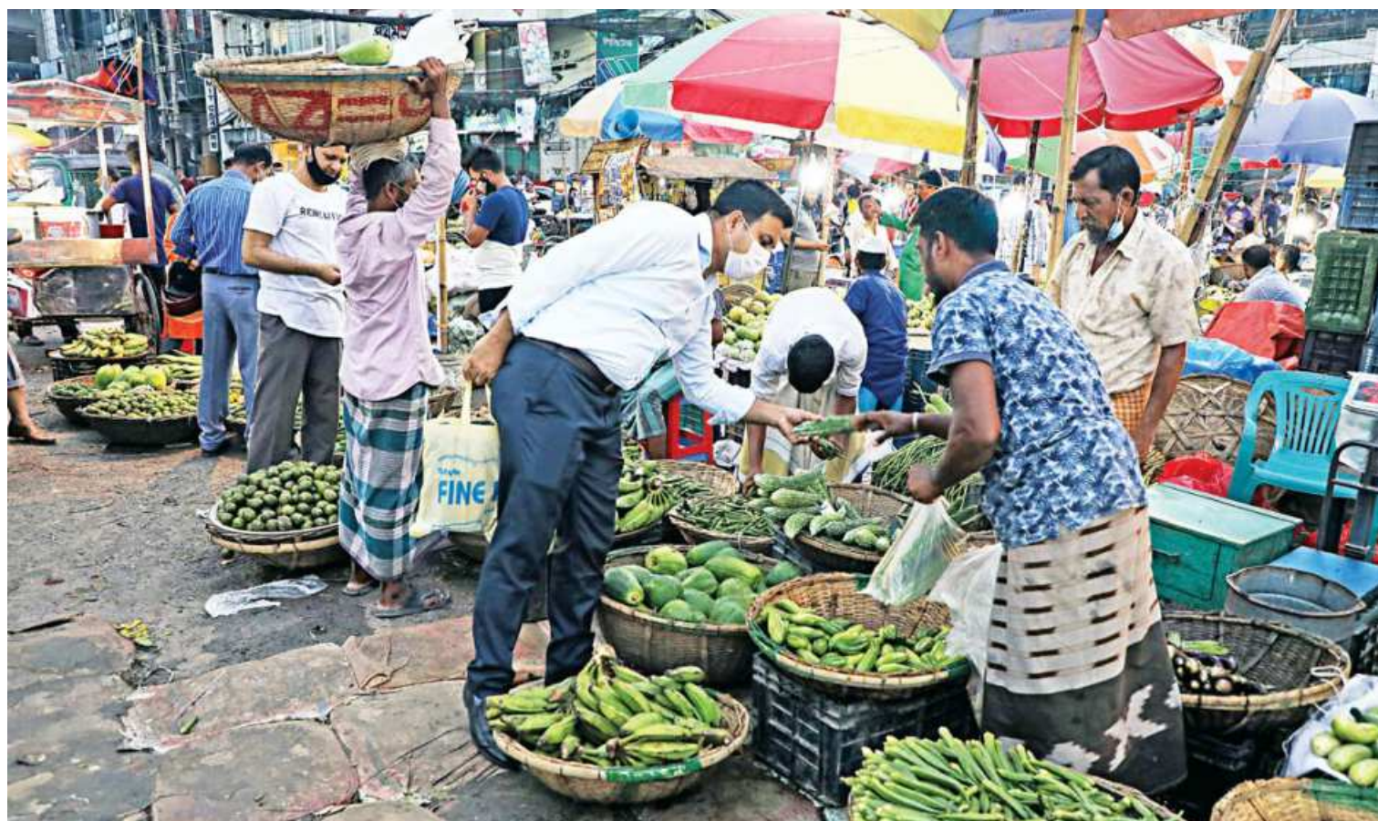
Prices of various vegetables dropped in July compared to those in the previous month, according to data from the Bangladesh Bureau of Statistics. The photo was taken from Karwan Bazar kitchen market in Dhaka yesterday.