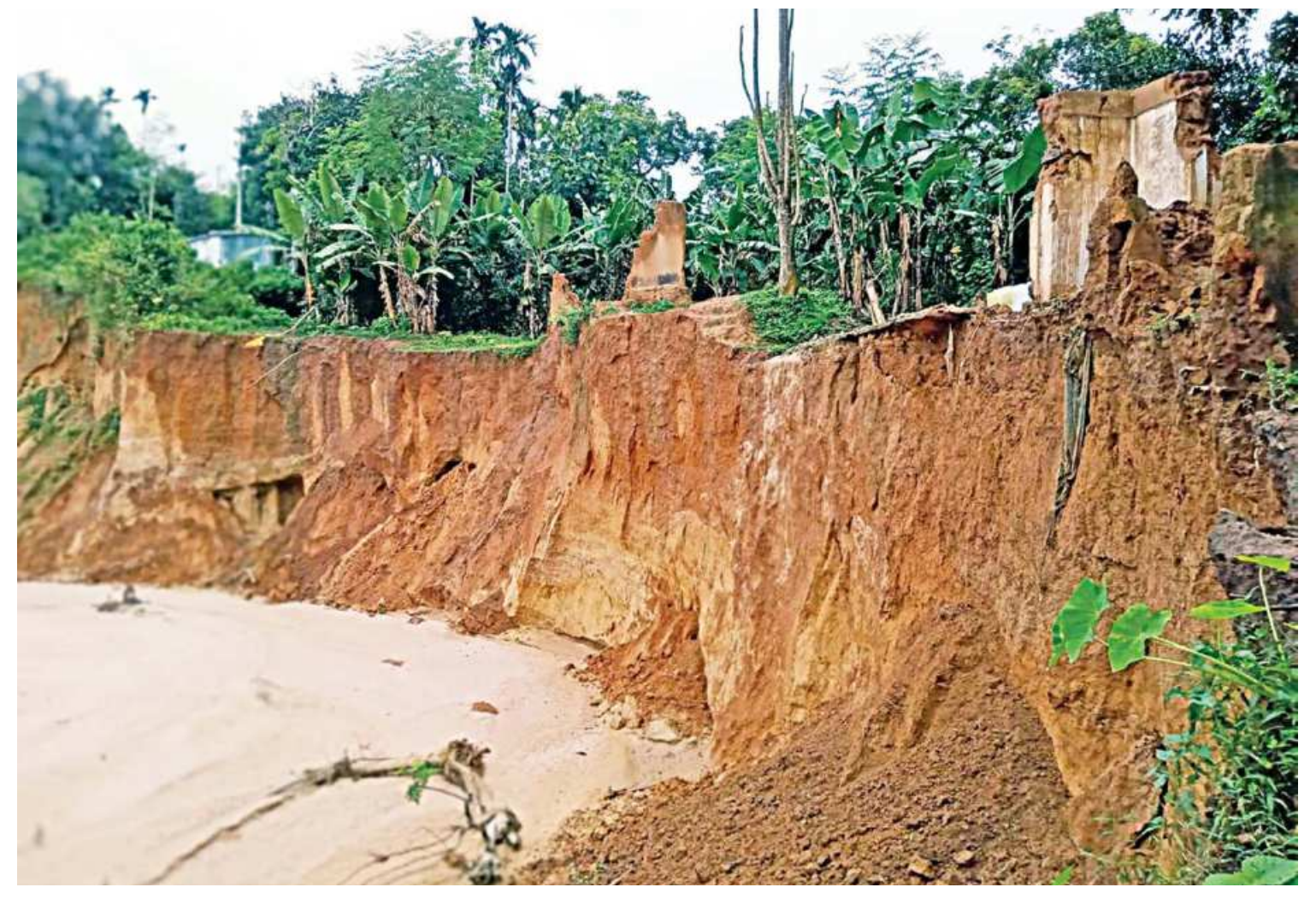
The Satchhari Tripura village in Habiganj's Chunarughat is on the verge of giving into the river as every time there is heavy rain, the rush of water erodes parts of the village. For years, the 24 families of the village have been living under this threat but nothing has been done to protect them. The photo was taken recently.