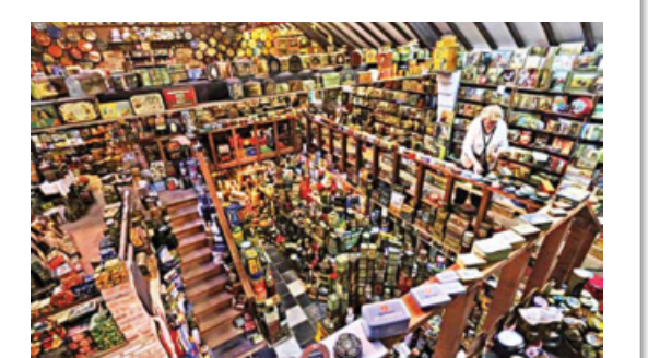
REUTERS, Grand Hallet

The colourful tins piled high around Belgian collector Yvette Dardenne used to contain goods ranging from chocolates, toffees, coffee and rice to tobacco, talc and shoe polish, and come from as far away as India. Yvette Dardenne, 83, has accumulated almost