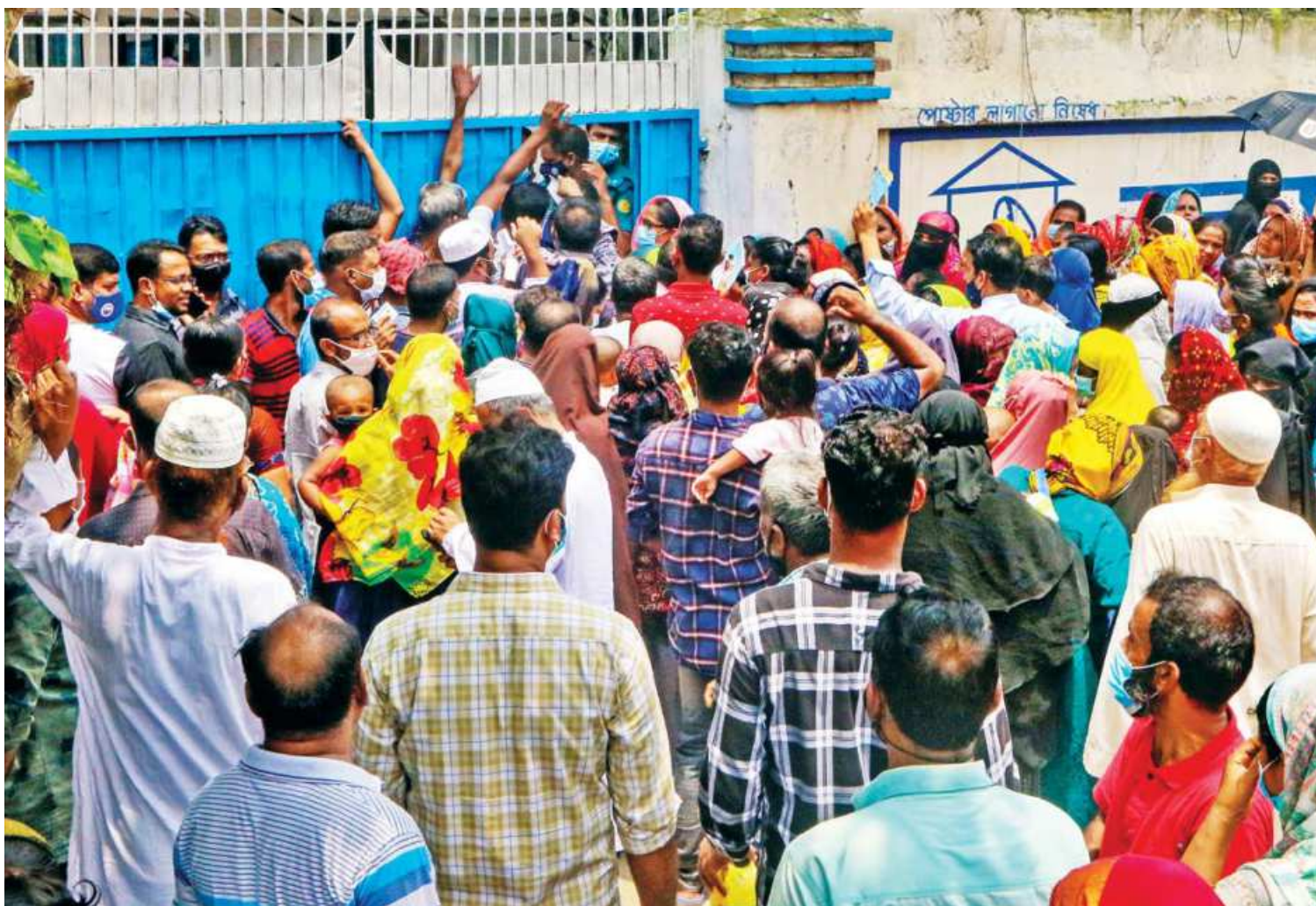
Waiting for hours in line to get their shots on the third day of the ongoing mass vaccination campaign, people complained about irregularities and chaos, adding that following health safety rules was impossible due to the heavy crowd. The photo was taken yesterday from Radda MCH-FP Center in Mirpur.