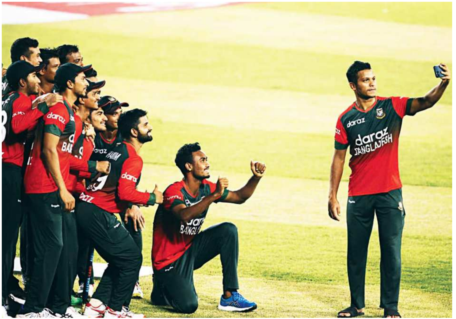
The Bangladesh players pose for a selfie following the fifth and final T20I against Australia which the Tigers won by 60 runs to wrap up the series 4-1 at the Sher-e-Bangla National Stadium yesterday.