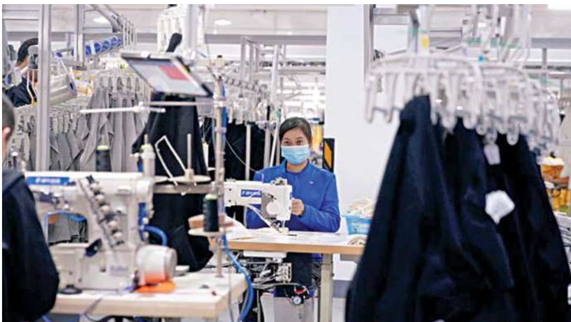
A woman works at Xunxi factory, which is an affiliate of Chinese e-commerce giant Alibaba, during a media tour, in Hangzhou, Zhejiang province, China.