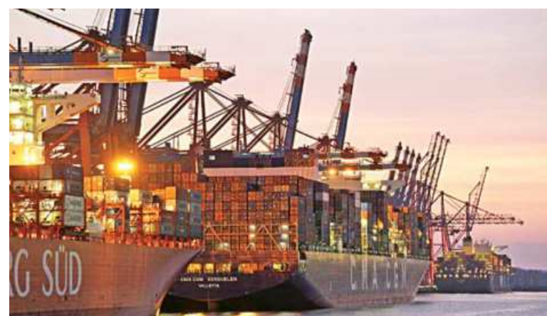
Container ships are loaded at a container terminal in the harbour amid the outbreak of coronavirus disease in Hamburg, Germany on March 29.

Seasonally adjusted exports jumped by 1.3 per cent on the month in June after a slightly revised