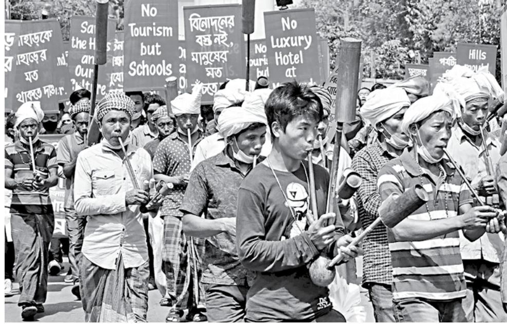
A group of Mro community members play their traditional musical instruments in the capital's Shahbagh, as a sign of protest over the luxury hotel that is being built on their ancestral land in Chattogram Hill Tracts.

The best example of this kind of land grabbing is the construction of a luxury five-star hotel on Mro people's traditional land in the Chimbuk range of Bandarban hill district. The ancestral lands of the Mro people have been reportedly encroached jointly by a welfare trust and business corporate giant Sikder Group's R&R Holdings Ltd. The hotel and its accompanying modern recreational facilities—including a dozen luxury villas, cable cars, and swimming pool—will adversely affect an estimated 800-1,000 acres of land belonging to nearly 600 indigenous families. Some Mro families have already been evicted while others are under threat of losing their lands. Mro villagers as well as different national and international advocacy groups staged rallies and signed petitions addressing policymakers, including the prime minister, amidst the Covid-19 crisis. However, a positive response is yet to come from the authorities to address the matter. As a consequence, the affected Mro community is passing its days in great uncertainty. Similarly, indigenous peoples in Madhupur of Tangail district, the Khasi people in Moulvibazar