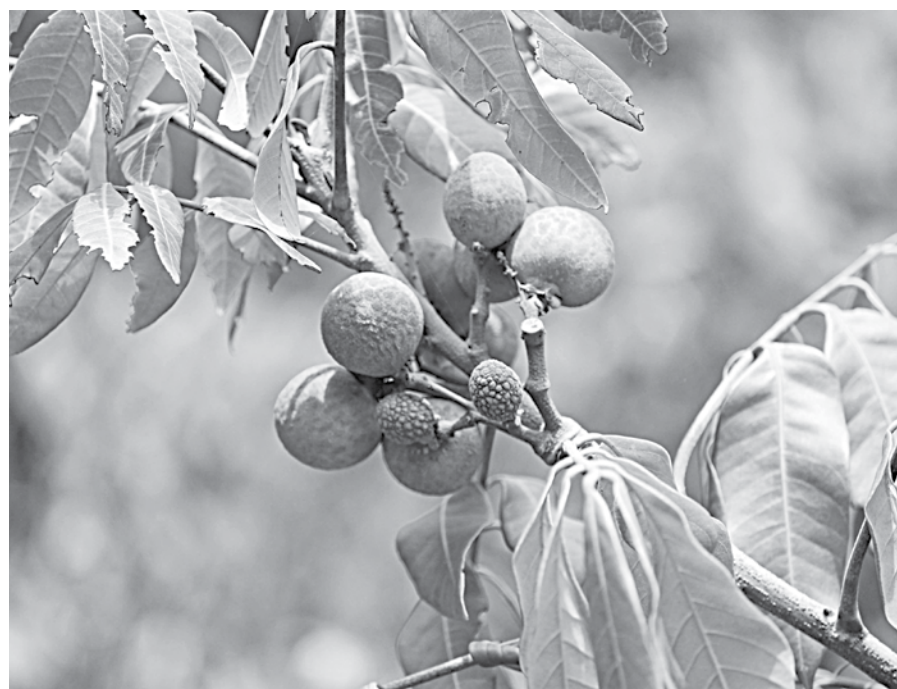
A bunch of succulent longans grown at Chapainawabganj Horticulture Centre. The photo was taken recently.

With that view in mind, the horticulture centre will grow around 1,000 saplings from the four mother trees and sell each sapling for Tk 50, he added.