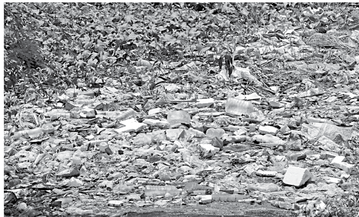
The main canal flowing through the municipality town has turned into a breeding-ground for mosquito due to unscrupulous dumping of garbage. Below, a swarm of mosquito is seen floating on the stagnant water of the canal.