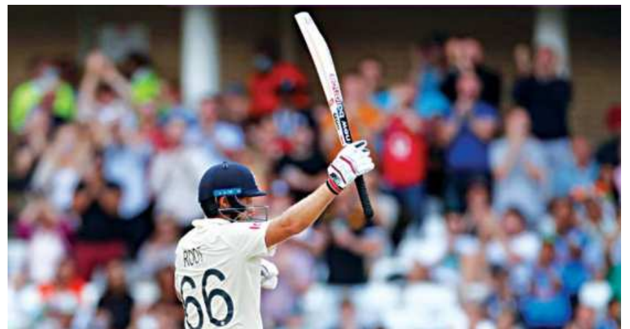
England captain Joe Root hit his 21st Test century during the penultimate day of the opening Test against India yesterday. Root made 109 as England scored 281 for 7 in 82 overs.