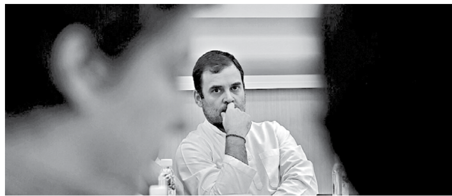
The August 2 meeting is supposed to carry the message that Rahul is ready to take over from his aging and ailing mother Sonia Gandhi.