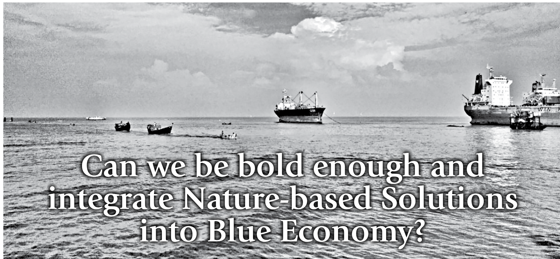
A view of Bay of Bengal from Sandwip, Chittagong.

Vegetable farmers should not have to suffer the brunt of supply chain disruptions. We believe they should not only be compensated duly for their losses, they must also be protected from similar losses during any future lockdowns. We would urge the government and concerned authorities to prioritise the survival of those who are most vulnerable to lengthy lockdowns.