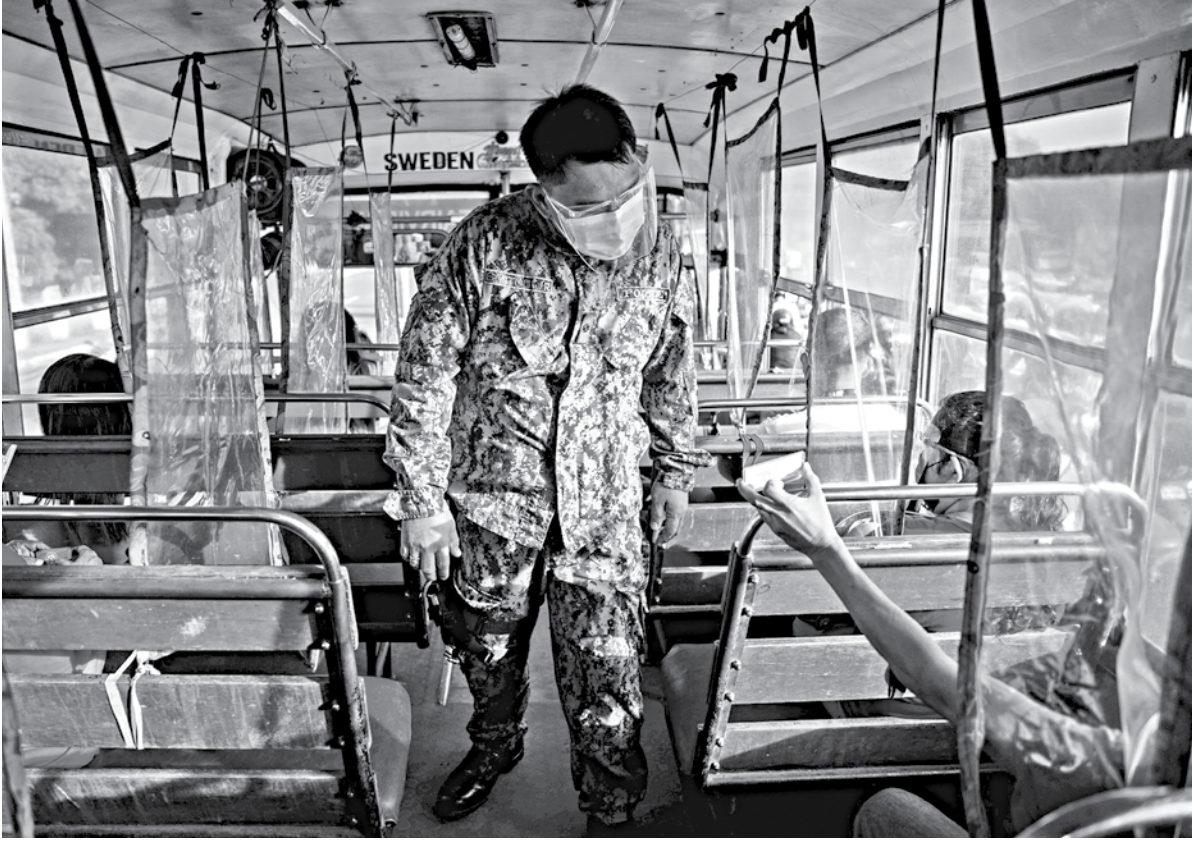
A policeman inspects an ID of a bus passenger passing through a checkpoint on the first day of a two-week lockdown to prevent the spread of the highly infectious coronavirus Delta variant, in Quezon City, Metro Manila, Philippines yesterday.

"We tried to send her today but the hospital authorities asked us to send her tomorrow as today is Friday."