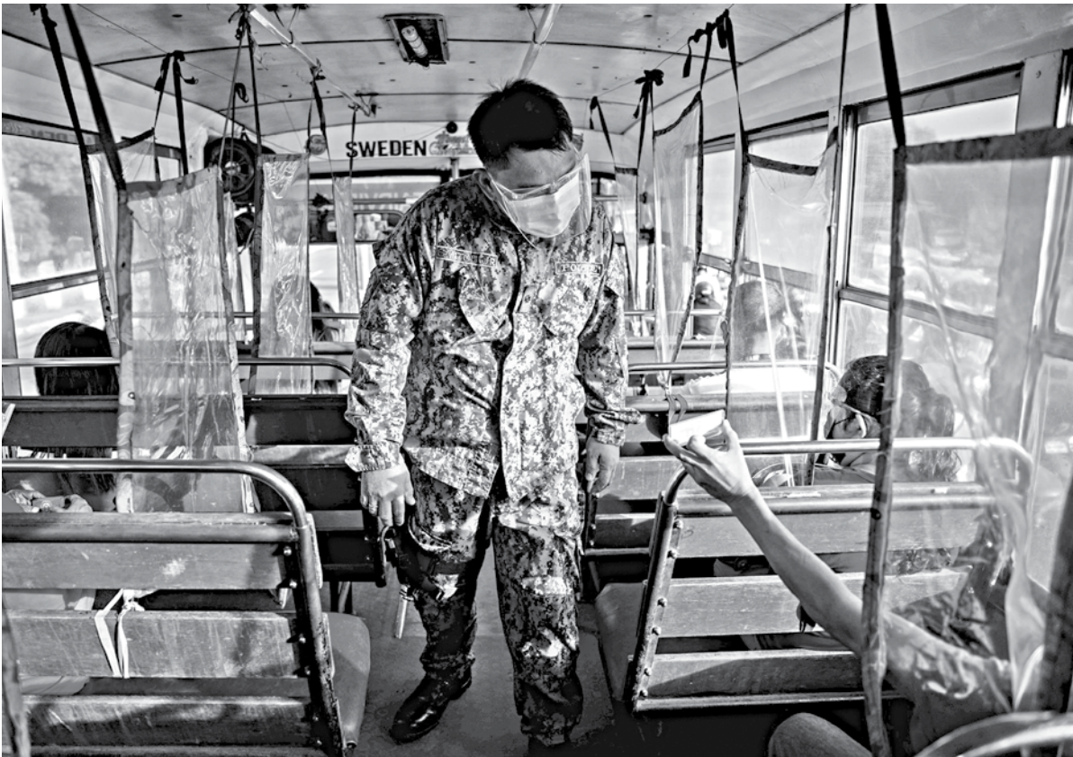
A policeman inspects an ID of a bus passenger passing through a checkpoint on the first day of a two-week lockdown to prevent the spread of the highly infectious coronavirus Delta variant, in Quezon City, Metro Manila, Philippines yesterday.

“We tried to send her today but the hospital authorities asked us to send her tomorrow as today is Friday.”