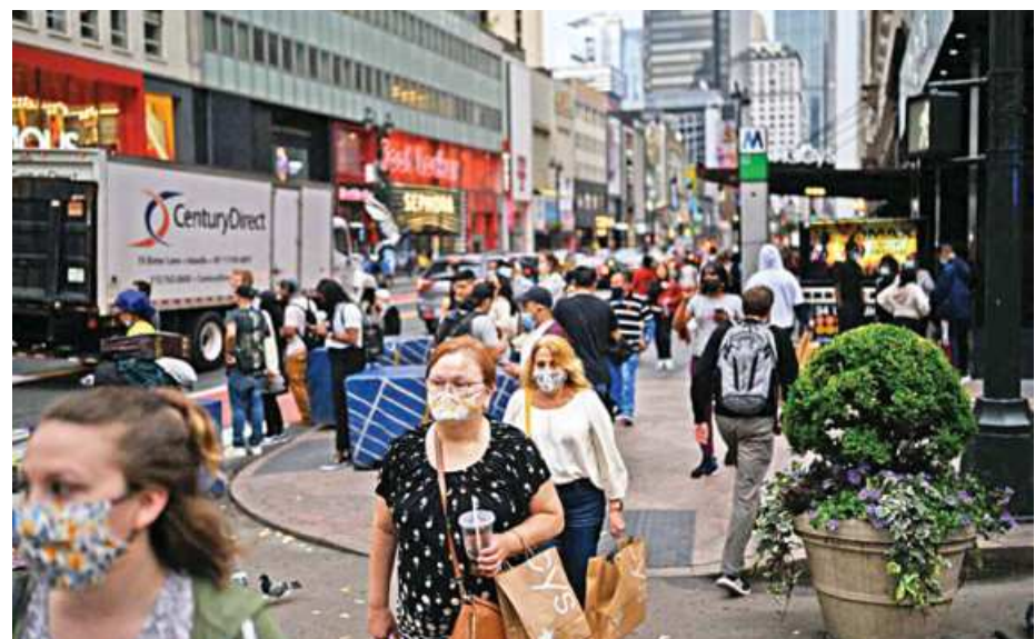
The slowdown in hiring underscores the challenges of a full labour market recovery in US.

Economists are projecting employment gains of over 900,000 and as much as a million in the key Labor Department employment report, and though the ADP data are not always in sync with the official figures, the big miss could foretell weak monthly hiring overall.