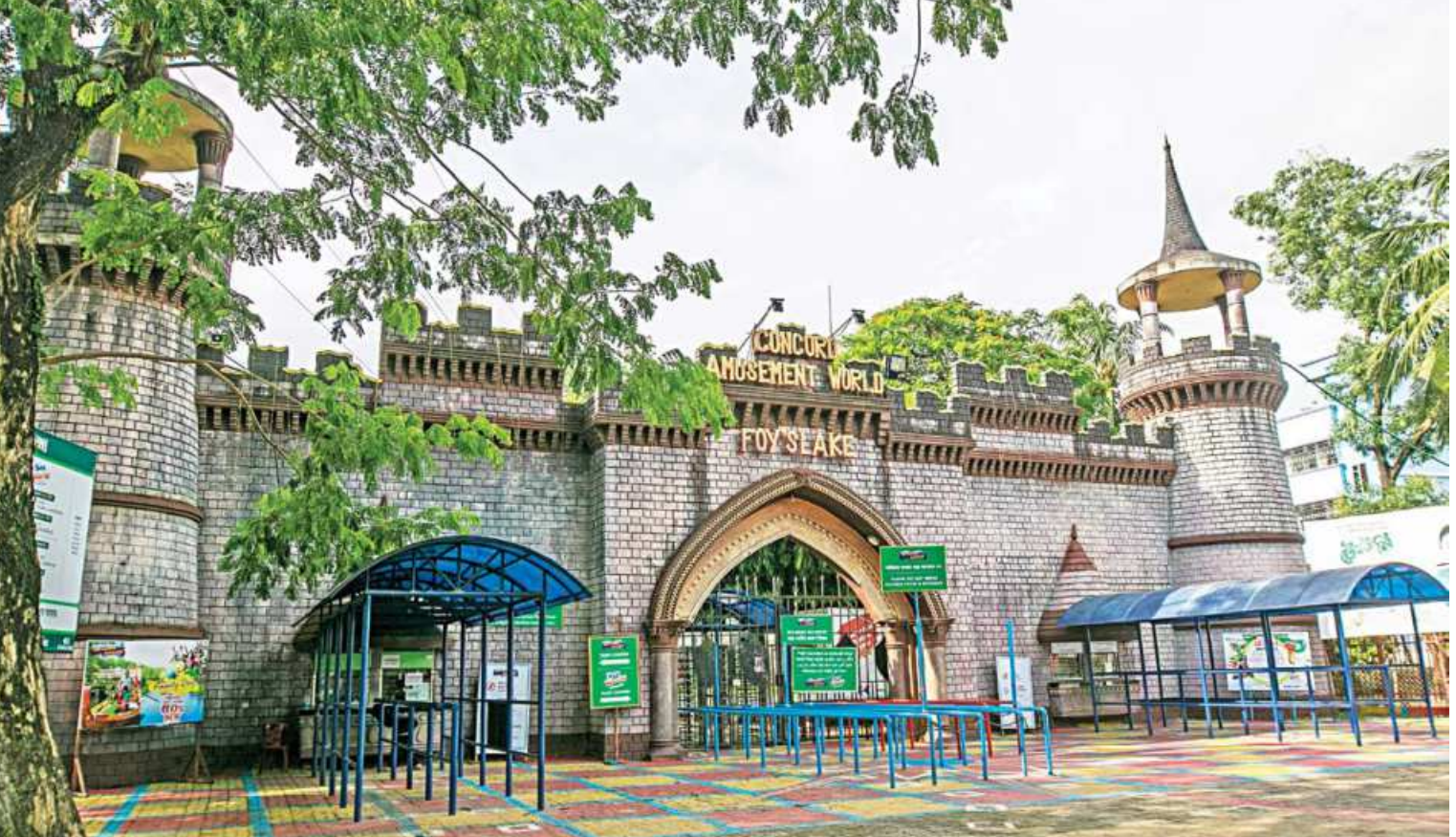
The Bangladesh Association of Amusement Parks and Attractions said it is possible to operate the parks maintaining safety rules and health protocol suggested by the government and other authorities. COLLECTED