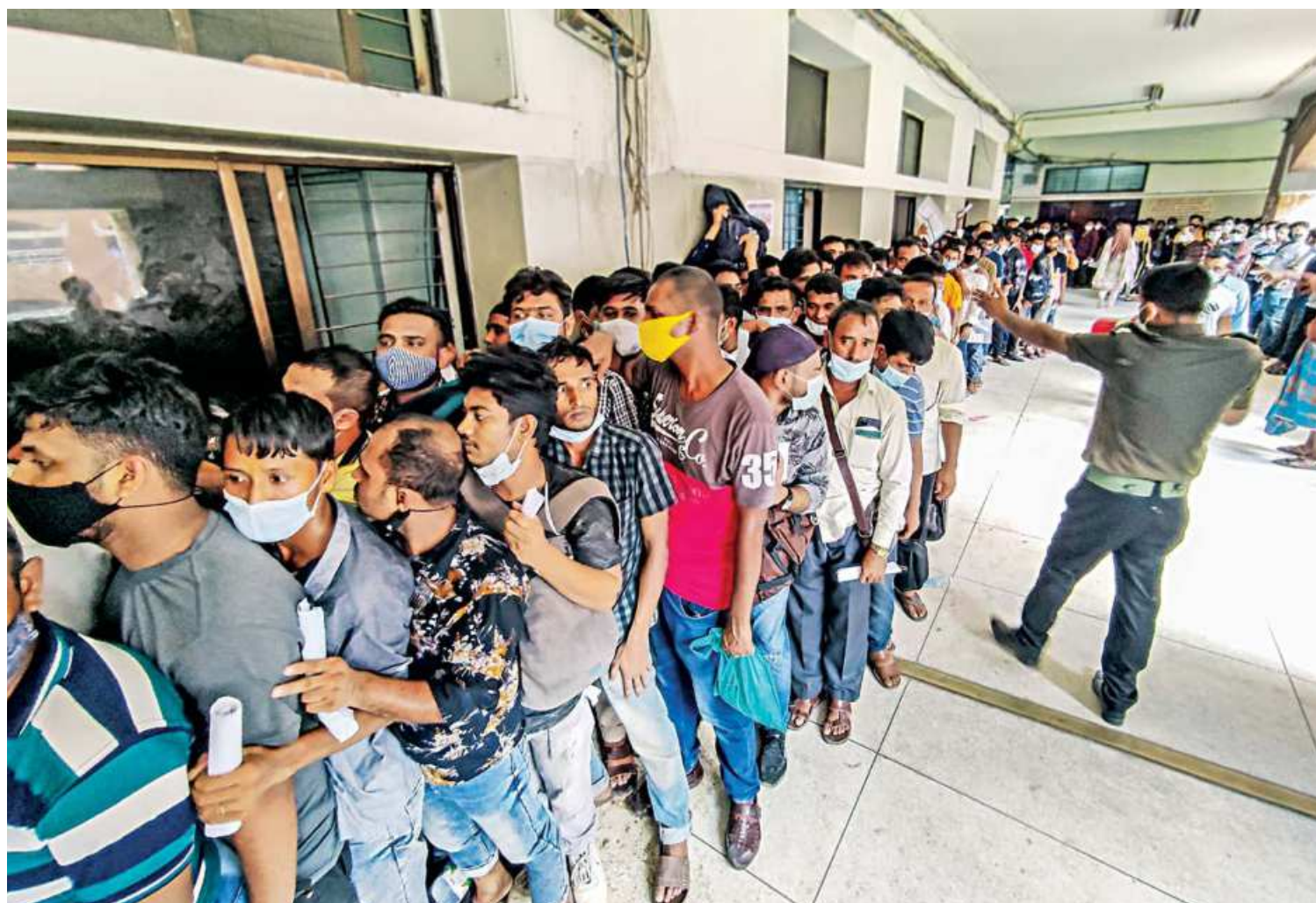
Migrant workers line up at Shaheed Suhrawardy Medical College Hospital to get vaccinated. Since they have been included and prioritised in the vaccine rollout, hundreds of them crowd public hospitals in the city every day to get their jobs. Social distancing and other health safety rules, however, are hardly maintained.