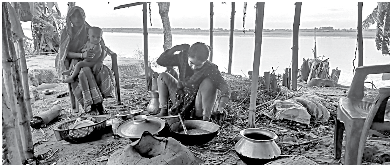
A woman is busy cooking daily meal with half of their homestead gone into the riverbed, however, she doesn't know whether the hearth will sustain the wrath of the ravaging Brahmaputra the next day. Below, a view of the eroding river in Dhanar Char village in Kurigram's Roumari upazila.