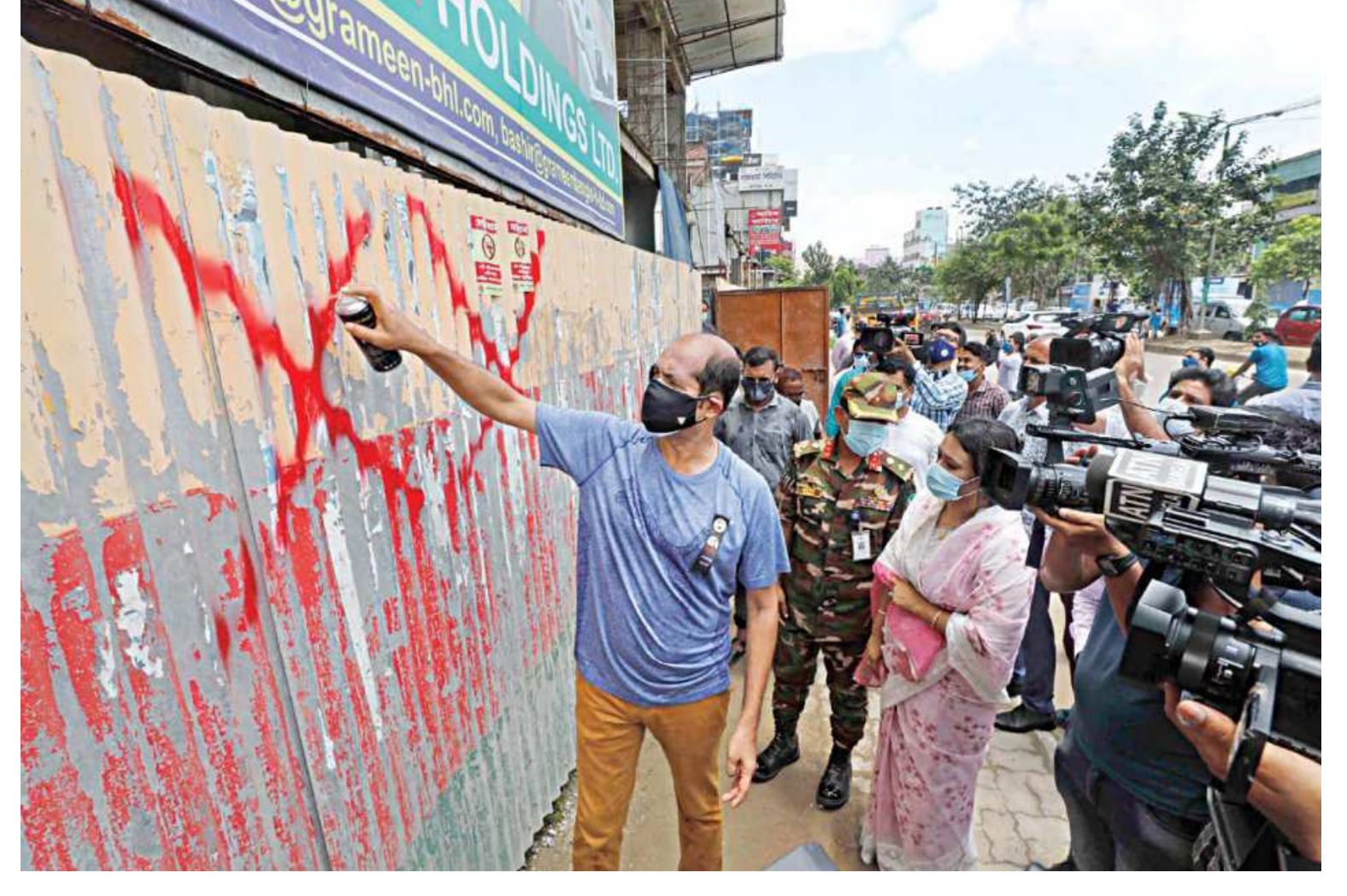
As dengue cases keep rising sharply in the capital, Dhaka North City Corporation's anti-dengue campaign is on full-swing to contain the threat. Mayor Atiqul Islam visited Bhatara area of the capital yesterday, and marked buildings where Aedes mosquito larvae were found. He urged citizens to all join hands in keeping their houses and surroundings clean.

Addressing an awareness programme in Bhatara area, the DNCC mayor said it is not the duty of mayors alone SEE PAGE 4 COL 3