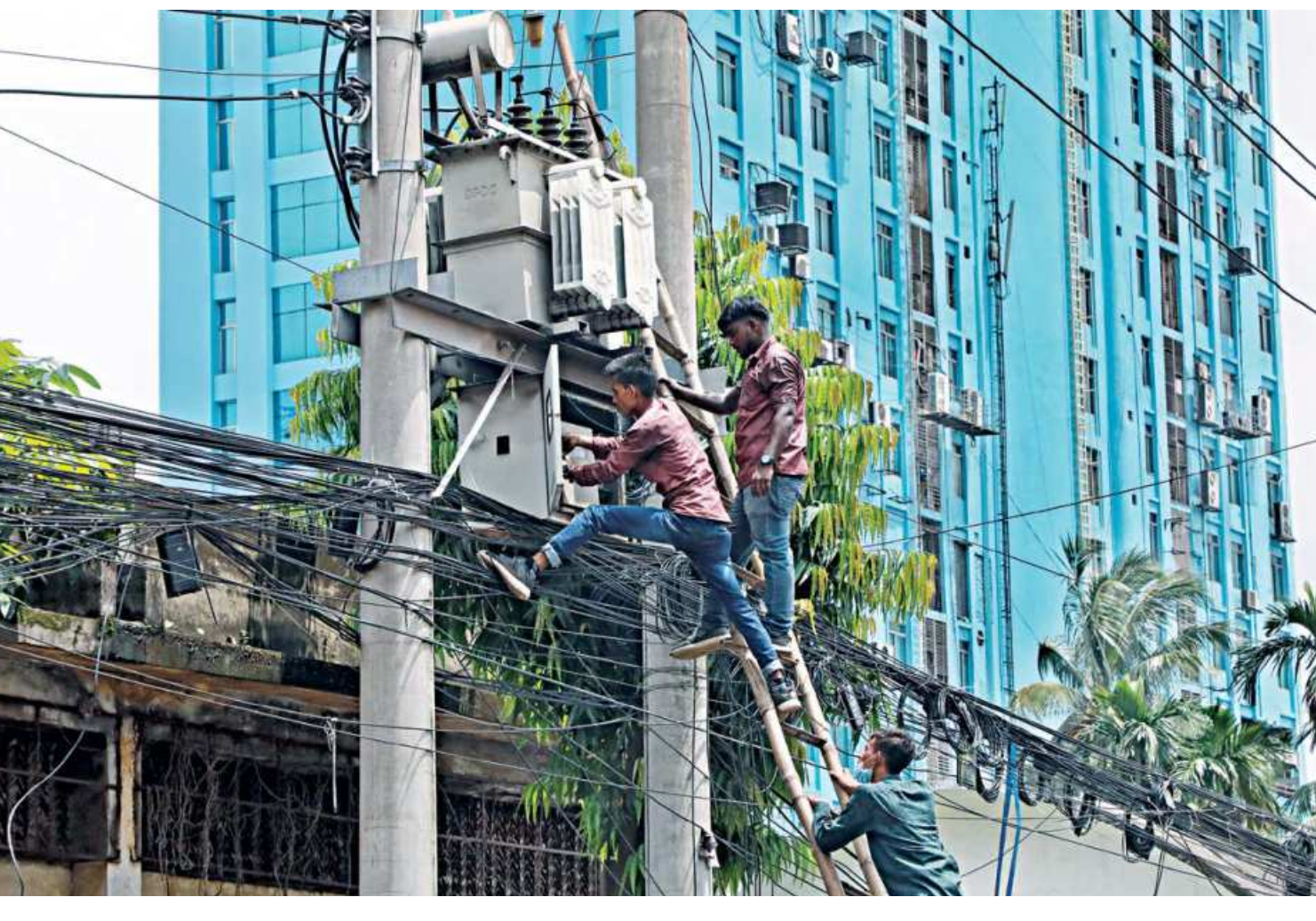
With one foot on the ladder and the other resting precariously on wires, an electrician along with his workmates is busy working on a transformer. One misstep at any point of the work may lead to a serious accident. This photo was taken yesterday from the capital's Tejgaon.

official. Sources in Biman said in the return flight to SEE PAGE 4 COL 3