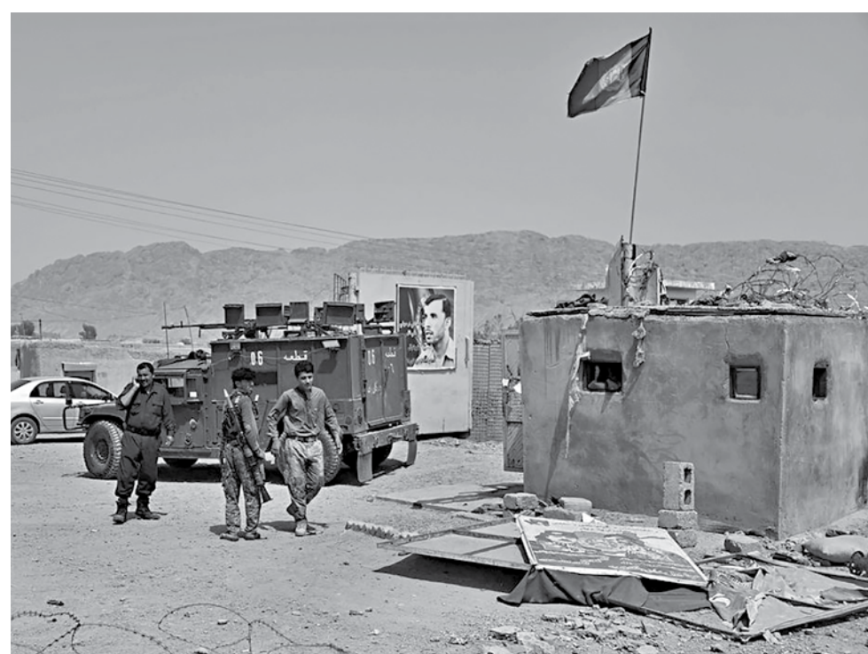
Afghan security forces inspect the site of a car bomb attack in Kandahar province, Afghanistan on July 6, 2021.

Bangladesh will have equally pressing concerns. With a history of Bangladeshis migrating to Afghanistan in the 1980s to join the Taliban in the anti-Soviet war and then returning to the country post-Soviet defeat—battle-hardened and well-trained in operating heavy arms—to create unrest internally, the country should be on the lookout to prevent this history from repeating itself. In 1992,