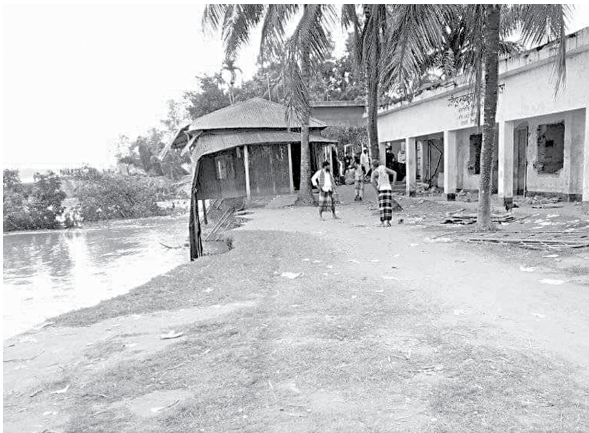
Alongside a madrasa, a mosque and a rural market place erosion by the Jamuna river devoured portion of Alipur Government Primary School under Gohaliabari union in Tangail's Kalihati upazila within five hours on Monday.