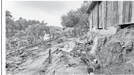
More than 50 families living along the Bhairab river are spending their days in fear of their houses and shops disappearing into the river.

Those whose houses have been demolished were living there illegally, the engineer added.