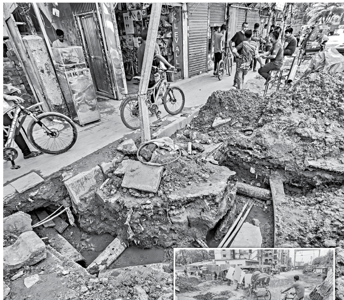
The Farmgate-Tejturi Bazar Road at the capital's Tejgaon was excavated for development work and has been in this state for a long time. With all the slopes, holes and mud, the road is almost unusable right now.