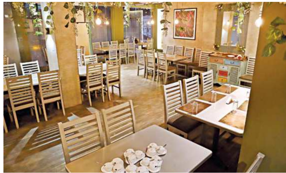
Around 80 per cent of the restaurants in the country are closed amid the current nationwide lockdown that began on July 23. The situation was similar during the two-month lockdown last year.

"Please save us, many of us cannot run their business," he added. Over the past decade, the number of restaurants in Bangladesh soared amid increased demand