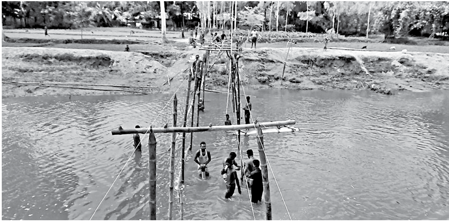
Volunteers from five villages in Nilphamari's Jaldhaka upazila working to make a new bamboo bridge on the Dhum river at Golmunda point. The photo was taken recently.