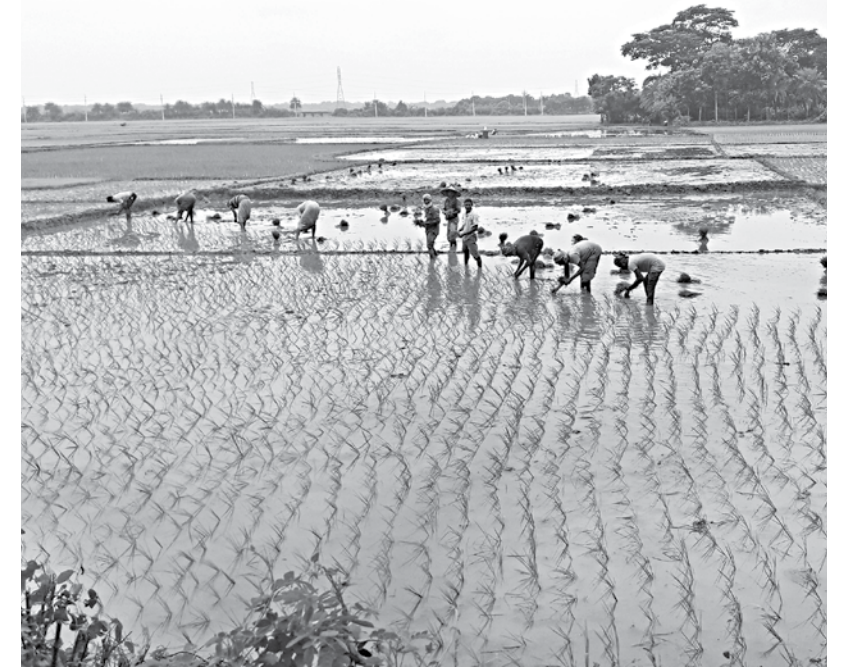
Farmers of Raghunathpur village under Kaliganj upazila in Jhenidah planting Ropa Aman paddy at a field.

1,04171 hectares of land in the district to be brought under Ropa Aman cultivation