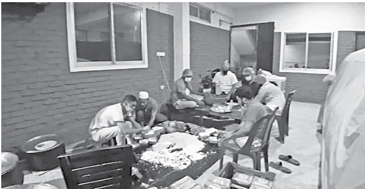
Members of SSC Batch '91, a voluntary organisation in Jashore, preparing free meal boxes for patients and their attendants at Jashore General Hospital. The organisation has been providing free dinner since the closure of restaurants due to the ongoing lockdown.