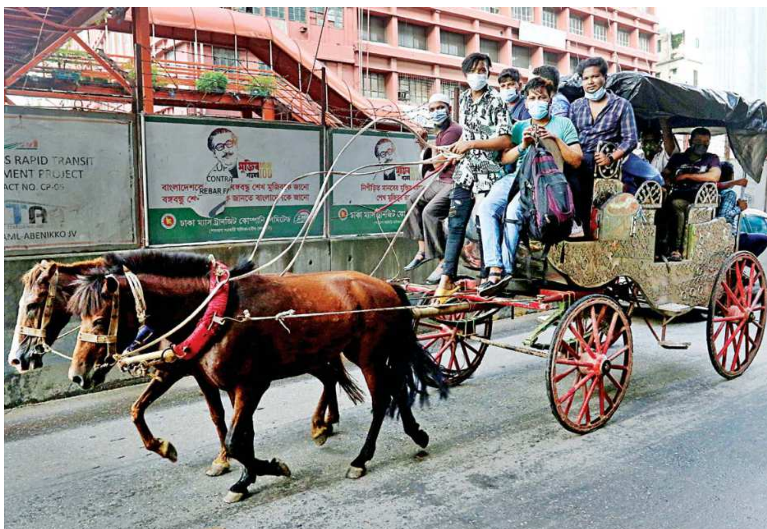
A horse-drawn carriage taking people from Gulistan to Mirpur in the capital during the lockdown imposed by the government to curb coronavirus spread yesterday. Due to the lack of public transport, carriage drivers are charging high for the ride. The trip costs Tk 250 per person. The photo was taken in Farmgate area.