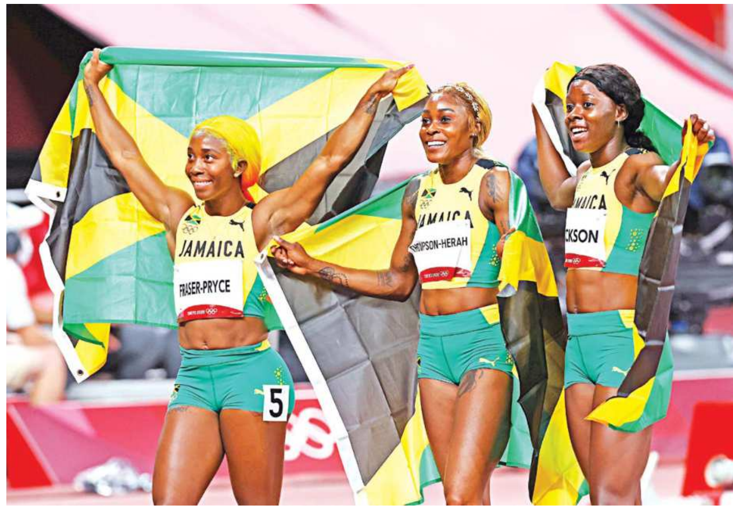
Elaine Thompson-Herah blazed to gold in the women's 100m sprint at the Tokyo Olympics yesterday, but Jamaica's star shone brightest as its athletes claimed all three places on the podium with Shelly-Ann Fraser-Pryce winning silver and Shericka Jackson claiming bronze.