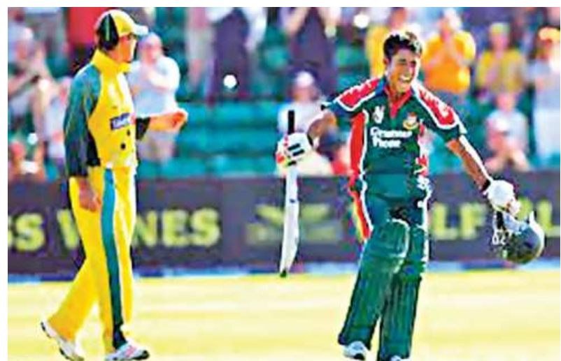
Bangladesh's greatest victory till date, a five-wicket humiliation of Australia in Cardiff in 2005, was engineered by Ashrafal's first ODI century -- a 101-ball 100. Meanwhile, Shakib Al Hasan was star with ten-for as Bangladesh carved a maiden Test win against Australia at Sher-e-Bangla National Stadium in Mirpur in 2017.

"Despite the fact that we will be without Tamim and Mushfiqur, I think the two openers – Soumya Sarkar and Naim Sheikh – have been in good touch recently and I give them the pass mark. In the middle-order, Mahmudullah can bat at Mushfiqur's position to fill that gap, so I don't see their absence to create a huge impact ultimately," Ashrafal added. Ashrafal concluded his views by saying how Shakib Al Hasan's rhythm and the consequent impact will be a crucial element from Bangladesh's perspective.