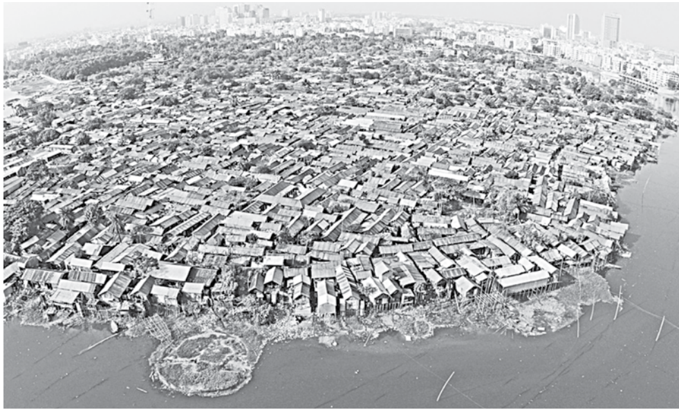
This aerial view of the Korail slum shows how difficult it would be to practice social distancing in such a congested area.