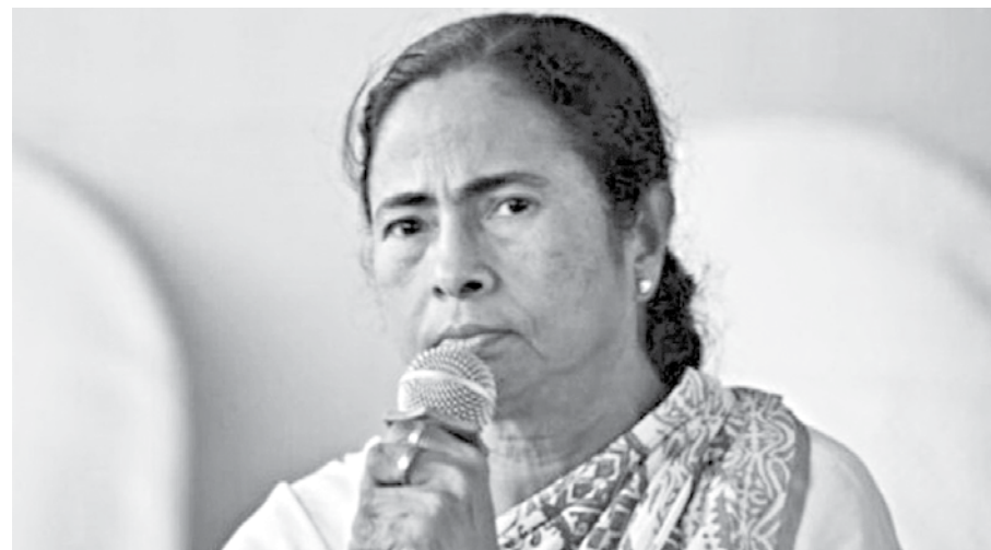
West Bengal Chief Minister Mamata Banerjee.

Many political commentators and opposition parties have hailed Mamata's victory in Bengal assembly poll as a big momentum builder towards opposition unity. But the rest of India is not Bengal.