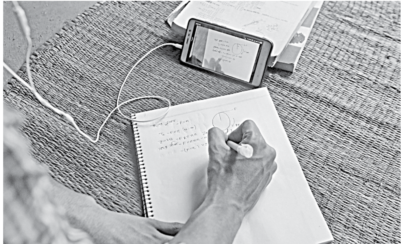
No one should miss out on education for lack of digital connectivity.

First, adopt a vision to implement education through digital means regardless of the pandemic situation. Second, prepare a policy to implement it. Third, mobilise all professionals such as students, teachers, subject matter specialists, educationists, and pedagogical experts. Include social influencers such as NGOs, political leaders, and the mass media in the process. Third, bring in the infrastructure providers such as telecom companies, internet service providers, cloud platforms, and hardware manufacturers. Fourth, set up an AI and Augmented Reality research centre